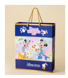
Paper Gift Bag

The restaurants and lounges will be serving special menus that feature dishes using colorful ingredients of the season and that are inspired by the Disney Friends having some Easter fun.