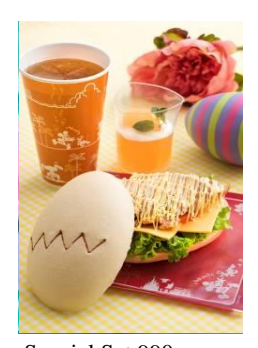
Special Set 990 yen at Sweetheart Cafe

menu themed to the "Usatama" characters. Other locations will also offer menus with ovalshaped souvenirs that feature an egg motif.