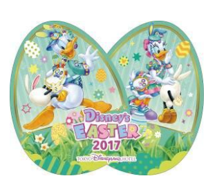
Tokyo Disneyland Hotel Postcard