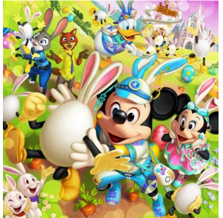
"Disney's Easter" at Tokyo Disneyland

At Tokyo Disneyland , the bunny-eared, mischief-making egg characters, "Usatama*," make their debut in the Park and cause a big commotion in the special event, " Disney's Easter ." The Disney Friends were busy making Easter eggs in preparation for Easter when a breakdown at the Easter egg factory led to the "Usatama" characters escaping into the Park and creating pandemonium! Along the parade route the Disney Friends try to catch the runaway "Usatama" characters in " Usatama on the Run! " Mickey Mouse and Friends dressed as "Usatama Chasers" attempt to catch the mischievous "Usatama" characters with giant vacuum cleaners and butterfly nets in this fun and zany, brand new parade. Judy Hopps and Nick Wilde from the Disney film Zootopia make their Park debut as