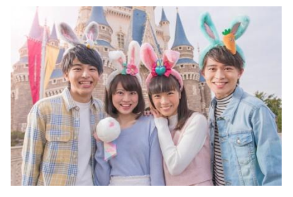
Bunny Ears Headband 1,300 yen each Hair Ties 500 yen each

About 30 types of items that feature Easter egg designs with a Disney Character motif will also be available, including for the first time Judy Hopps and Nick Wilde from the Disney film Zootopia and Nemo and Dory from the Disney Pixar film Finding Nemo . Continuing from last year will be items that have a feminine appeal such as pastel-colored apparel and bags with designs of Miss Bunny, Thumper and other cute bunnies, as well as loungewear, hair accessories, and other items for everyday use.