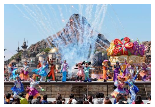
"Fashionable Easter" at Tokyo DisneySea

Friends will be sporting this season's must-have fashion item, the Easter "Bunny" Bonnet (a prettily decorated hat complete with bunny ears) to make Easter at Tokyo DisneySea a fashionably fun event. Presented at Mediterranean Harbor is " Fashionable Easter. " This special show features the Disney friends in colorful new costumes, and artists from American Waterfront, Mermaid Lagoon and two other themed ports wearing wonderfully stylish outfits as they present music and dances that represent the themes of the different