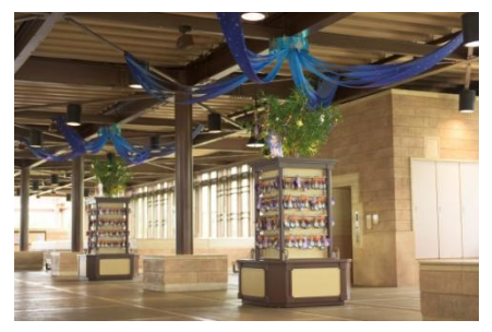
Wishing Place at Tokyo DisneySea Station.