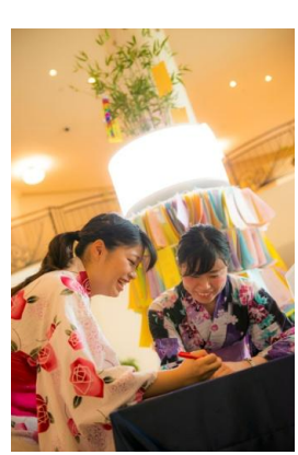
Wishing Cards at Ikspiari.

A Tanabata event will also be held at Ikspiari . Wishing Cards will be distributed to Guests at Ikspiari in commemoration of its anniversary on July 7, the day of Tanabata. Guests can write their wishes and hang the cards on the bamboo branches that are decorated for this summer festival. Restaurants and shops will offer special merchandise and menus to celebrate Ikspiari's 16th anniversary.