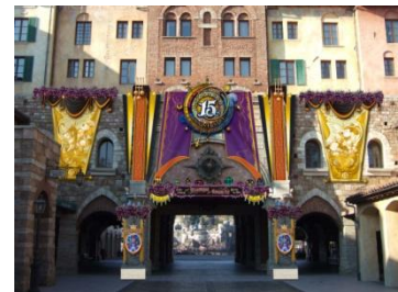
Decorations at Tokyo DisneySea

At Tokyo DisneySea , Guests will find decorations themed to “a cool and spooky Halloween with the Disney Villains” in addition to the Tokyo DisneySea 15th Anniversary motifs. Passaggio MiraCosta will be themed as the entrance to the world of the villains and banners designed with the villains will decorate the walls and ceiling of the corridor. A cool, but spooky Halloween atmosphere will await Guests with decorations of the various villains and photo locations at Mediterranean Harbor and the New York area of American Waterfront, and decorations themed to Jafar in Arabian Coast.