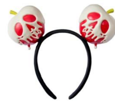
Hairband (1,800 yen) at Tokyo DisneySea

At Tokyo DisneySea , Guests will find about 50 different types of Tokyo DisneySea special merchandise, including a variety of items designed with the Disney Villains and the Disney Friends from the show, “ The Villains World: Wishes and Desires. ” Also available will be around 20 different types of merchandise showing Duffy and his friends enjoying Halloween.