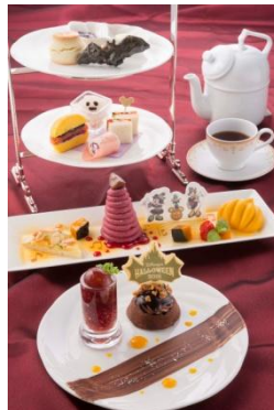
Afternoon Tea Set at Dreamers Lounge, Tokyo Disneyland® Hotel