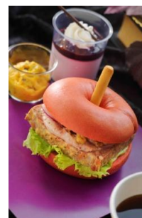
Special Set inspired by the Queen from Snow White and the Seven Dwarfs (1,150 yen) at New York Deli

At Tokyo DisneySea , special set meals incorporating motifs inspired by the Disney Villains will be offered. The special set at New York Deli features the Queen from Snow White and the Seven Dwarfs and the one at Zambini Brothers' Ristorante is inspired by Ursula from The Little Mermaid , while the special set of black curry and red naan at Casbah Food Court is inspired by the colors of Jafar's costume. In addition, popcorn cases with images of the Disney Villains and the Disney Friends will be sold in the Park. And at Cape Cod Cook-Off in American Waterfront, Guests can enjoy a special set that comes in a Duffy lunch case, as well as a limited-period dessert with a souvenir cup.