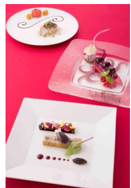
Lunch Course at Oceano, Tokyo DisneySea Hotel MiraCosta®