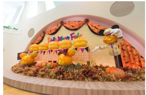
Decoration at Resort Gateway Station

The design of some Disney Resort Line monorail trains will change to Halloween motifs during this period. Also, limited-period day passes will be available in two different designs featuring “Disney’s Halloween” at Tokyo Disneyland and Tokyo DisneySea. All of the Disney Resort Line stations will be decorated with Halloween motifs to welcome Guests.