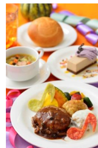
Special Set (1,940 yen) at Plaza Pavilion Restaurant

And at the popcorn wagons, Halloween popcorn cases will be sold only during this period.