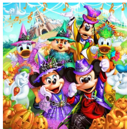
Disney's Halloween at Tokyo Disneyland

The special event at Tokyo Disneyland Park will be themed to a Halloween music festival. Mickey Mouse and his Disney Friends join ghost and skeleton “stars” in entertaining Guests with a variety of amusing and exciting musical performances in “ Halloween Pop'n LIVE, ” presented along the parade route. Each of the units in this parade will be uniquely themed to a different genre of music and decorated with jack-o'-lanterns, skeletons and other Halloween motifs. The Disney Friends wearing Halloween costumes that match the theme of the units will appear on the floats as the fun and dynamic music plays, making Guests want to dance along. With the decorations in World Bazaar and around the Plaza also featuring the Halloween music festival theme, Guests will find a lively atmosphere filling the Park.