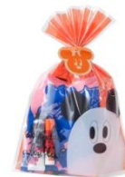
Gift Wrap Bag (500 yen) at Tokyo Disneyland and Tokyo DisneySea

Available at both Tokyo Disneyland and Tokyo DisneySea will be about 90 types of merchandise with colorful designs of ghosts and pumpkins besides designs of Mickey Mouse dressed up as a vampire. In addition, there will be pen sets, hand cream sets, and other items to share with friends as well as gift wrap bags for those types of items.