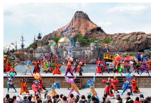
Disney's Halloween at Tokyo DisneySea

Tokyo DisneySea Park, which is currently holding the “Tokyo DisneySea 15th Anniversary: The Year of Wishes” special event, will present a cool, but eerie Halloween event themed to the Disney Villains*. This year, to celebrate the Park's 15th Anniversary, the Disney Villains make it an even more exciting Villains-style Halloween with Mickey Mouse and the Disney Friends. Presented at Mediterranean Harbor will be “ The Villains World: Wishes and Desires. ” In this harbor show, the Disney Villains take the leading roles and they put on their best performances to attract and impress the Disney Friends and Guests. Dressed in costumes inspired by the Disney Villains, Mickey Mouse, his friends and all the Guests join the party and raise the level of Halloween excitement.