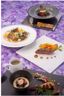
Empire Dinner at Empire Grill, Disney Ambassador® Hotel