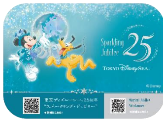
Concept image of the curtains