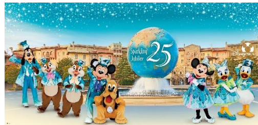
Concept image of the station installation

Note: Details will be announced on the Tokyo Disney Resort Official Website once they are finalized.