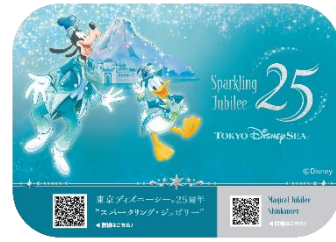
Concept image of the interior decals

“Jubilee Blue,” the Tokyo DisneySea® Park 25th anniversary theme color that draws inspiration from the captivating seas, will be prominently featured on the “Magical Jubilee Shinkansen” through various designs. These include Mickey Mouse and other Disney friends, dressed up in anniversary-themed attire, as well as DisneySea AquaSphere — the symbol of Tokyo DisneySea — and Mount Prometheus. The celebratory atmosphere of Tokyo DisneySea 25th “Sparkling Jubilee” will also be reflected inside the cars through the headrest pillows and melodies that play during operation. Guests can look forward to sharing in the celebrations as they travel on these special trains.