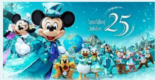
Tokyo DisneySea 25th “Sparkling Jubilee”

https://www.tokyodisneyresort.jp/treasure/tds25th/en/