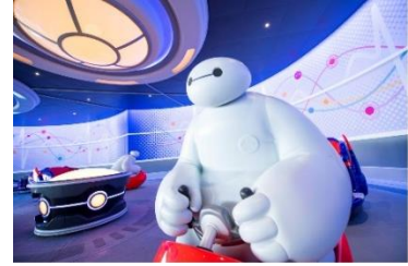
The Happy Ride with Baymax

In this attraction, Baymax’s nursebot friends pull the vehicle, whirling guests around in unexpected and thrilling ways. With the addition of this upbeat track, guests can expect even more smiles and a heightened “level of happiness.”