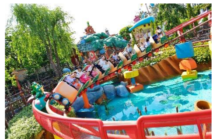
Gadget’s Go Coaster

Gadget’s latest invention, the thrilling, action-packed Gadget’s Go Coaster, will be presented in a special limited-period “Get Soaked” version. As the ride bursts through jets of water erupting like fountains, guests can expect to come away absolutely drenched in an experience that is exciting and refreshing.