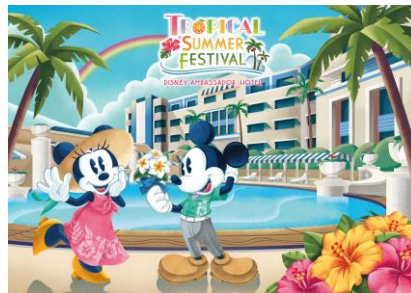
Tropical Summer Festival