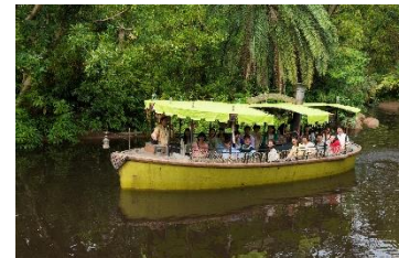
Jungle Cruise: Wildlife Expeditions

In Jungle Cruise: Wildlife Expeditions, guests board a boat with a fun-loving skipper who takes them on a journey through the jungle, and reveals the most important thing to know about the jungle. The skippers have a special memento (a sticker) to award guests as proof of uncovering the jungle’s greatest lesson, and are awaiting eager explorers to share in a jungle adventure.