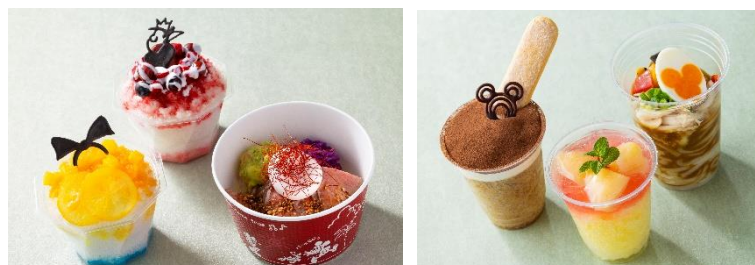
Recommended Menu Items for the Summer

At Tokyo DisneySea, guests can explore two different styles of granita: Cafe Portofino will serve a rich and creamy tiramisu-style granita with mascarpone cream, while Zambini Brothers' Ristorante will offer a sweet and tangy peach and lemon granita. At Sultan's Oasis , guests can enjoy Chilled Curry-Flavored Udon, and both parks will be serving a variety of chilled noodles during the event period.