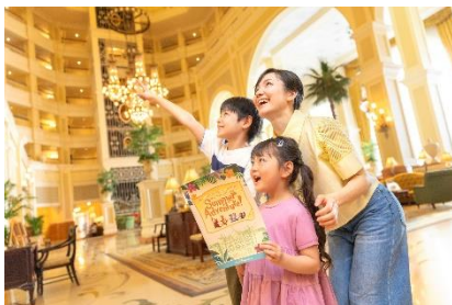
Concept image of guests enjoying the program