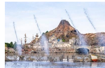
“Get Soaked” Harbor Splash

At Piazza Topolino, “Get Soaked’ Harbor Splash” will be presented again this year. Guests can look forward to getting drenched by torrents of water, and during “ Splash Time ,” an even more invigorating water spray will accompany “Carrying Happiness (Tokyo Disney Resort Version)” by Mrs. GREEN APPLE, creating a fun-soaked and refreshing atmosphere.