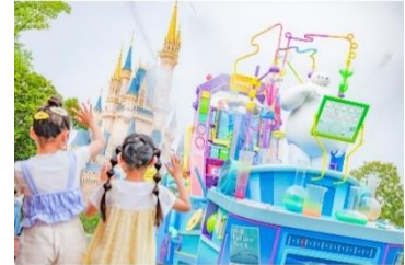
Baymax’s Mission: Cool Down

This fun Get Soaked Program presented along the parade route features Baymax, the personal healthcare companion robot from the Walt Disney Animation Studios film Big Hero 6 , as he protects guests from the summer heat.