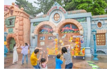
“Get Soaked” Toontown

Fun zones where guests can get soaked will pop up around Toontown again this year. The Trolley Barn at Jolly Trolley will feature cool mist and spraying water, and Toontown Fire Department and Fireworks Factory will also spout water. Guests of all ages can enjoy the hot summer months with these water-splashing spots.