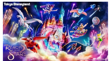
“Reach for the Stars”

“Reach for the Stars,” which has been delighting guests since 2024, will be presented for the final time this summer as “Reach for the Stars: Everlasting Dreams.” From July 2, a special addition to the show will be presented after the end of the main performance, featuring music exclusive to this event period. Don’t miss this perfect farewell to this breathtaking nighttime spectacular, that brings beloved characters to life as they reach for the stars in pursuit of their dreams.