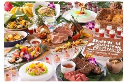
Chef Mickey (Buffet) Hawaiian-Style Lunch/Dinner Buffet