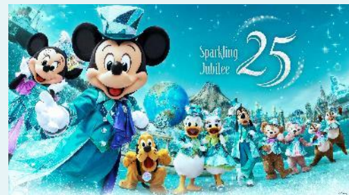
Tokyo DisneySea 25th “Sparkling Jubilee”

https://www.tokyodisneyresort.jp/treasure/tds25th/en/