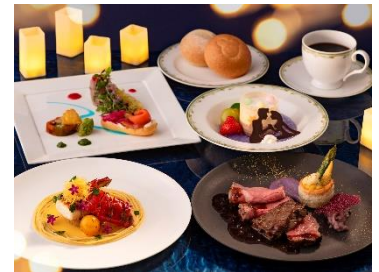
Chef’s Imagination: Special Course 8,800 yen – 13,400 yen Available at: S.S. Columbia Dining Room Sales begin: April 16

The course meal reflects various scenes from the attraction, starting with an appetizer symbolizing the scene where guests embark on their journey by boat, followed by a fish dish that captures Rapunzel’s excitement as she emerges from the tower for the first time, and a meat dish inspired by the enchanting night of the Lantern Festival.