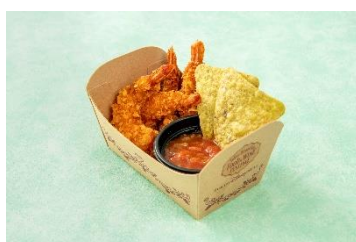
Fried Shrimp & Salsa 650 yen Available at: Yucatan Base Camp Grill