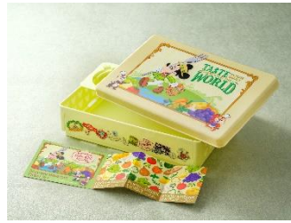
Seasonal Gourmet Ticket Set 3,400 yen