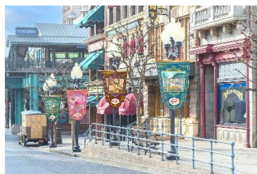
Banners depicting Disney friends enjoying their time at the festival