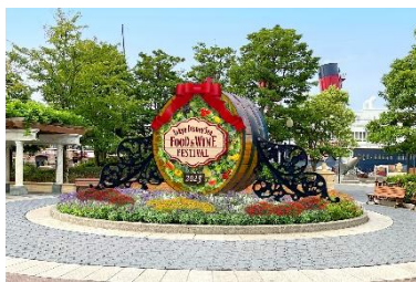
Decorations at Waterfront Park

Throughout the park, including the entrances of each restaurant, decorations will welcome guests to the Tokyo DisneySea Food & Wine Festival. The New York area of American Waterfront, the heart of the festival, will be adorned with colorful flowers and large wine barrels, signaling the arrival of spring and the festival. Banners depicting Disney characters having fun at the festival will further enhance the cheerful ambiance. Additionally, there will be photo spots featuring Mickey enjoying cuisine during his travels.