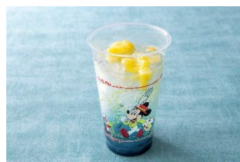
Sparkling Drink (Pineapple & Coconut Flavor) 700 yen Available at: Zambini Brothers’ Ristorante

Additionally, at Cafe Portofino, Horizon Bay Restaurant and Vulcania Restaurant, guests can enjoy a Tasting Selection featuring appetizers paired with a variety of beers and wines, and discover their favorite combinations and flavors through these pairings.