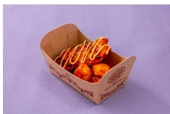
Tandoori Chicken with Cheese Sauce 650 yen Available at: Casbah Food Court