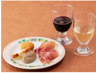
Tasting Selection 1,800 yen Available at: Cafe Portofino