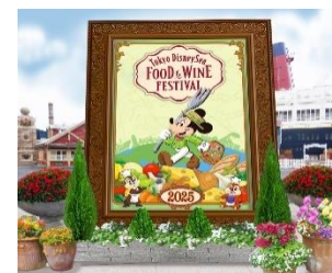
Photo spot in front of S.S. Columbia