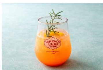
Sparkling Cocktail (Pisco & Tropical Fruit Syrup) 880 yen Available at: Yucatan Base Camp Grill

Over at Casbah Food Court in Arabian Coast, guests can enjoy tandoori chicken topped with cheese sauce and served with spicy potatoes, along with other dishes and beverages that highlight the unique flavors and ambience of the themed ports. Additionally, at Zambini Brothers’ Ristorante, guests can enjoy a sparkling drink inspired by the iconic DisneySea AquaSphere. When mixed, the drink shimmers like the Northern Lights. There are also numerous soft drink options available for children and guests who prefer non-alcoholic beverages.