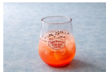
Sparkling Cocktail (Whiskey & Citrus) 880 yen Available at: Nautilus Galley