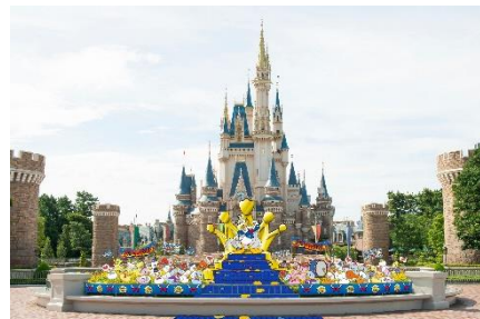
Scenery of Duck City (Plaza)