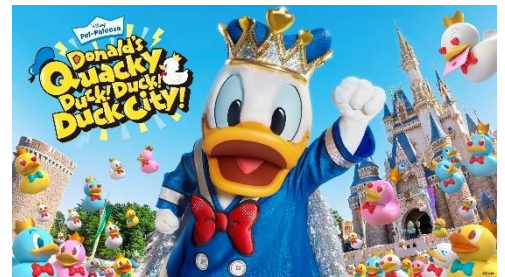
Donald’s Quacky Duck! Duck! Duck City!

This event series is all about having a blast with your “pals” in the park in a party-like, “palooza,” environment. In this fourth installment, Donald Duck returns as the main character after starring in the second event, Donald’s Quacky Duck City. Donald, who cannot give up on his dream of becoming the King of Superstars, returns to his ideal city of “Duck City.” Surrounded by “Quacky Ducks,” the fans that he created in his dreams, Duck City will be bustling with festivities.