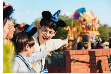
Vacation Package Exclusive Viewing Seats Plaza Garden