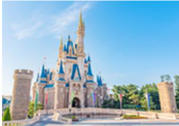
Viewing Area at Castle Forecourt

Tokyo Disney Resort Vacation Packages, the official accommodations plan, will offer a variety of plans for guests to enjoy the parks to the fullest. The newly added options include a plan with a show viewing ticket for the parade “Quacky Celebration ★ Donald the Legend!” presented as part of the Donald’s Quacky Duck! Duck! Duck City! special event.