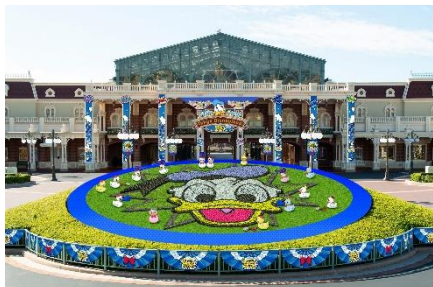
Donald Flower Bed at the Park Entrance

The Mickey Flower Bed by the park entrance will be transformed into a Donald Flower Bed and a grand Donald marquee will adorn the entrance to World Bazaar. Guests will also be able to take photos with a monument dedicated to Donald that will be set up at the center of World Bazaar. Furthermore, the Plaza in front of Cinderella Castle will feature decorations themed to the event and the entire park will be filled with “Quacky Ducks,” transforming the park into a whimsical and exciting world.