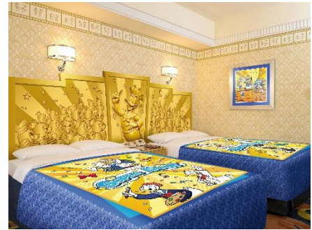
Disney Pal-Palooza “Donald’s Quacky Duck! Duck! Duck City!” Special Room

From April 8 through June 30, “Disney Pal-Palooza ‘Donald’s Quacky Duck! Duck! Duck City!’” Special Rooms will be available at Disney Ambassador® Hotel . These rooms feature headboards with designs of Donald surrounded by Quacky Ducks along with artwork depicting Mickey Mouse and his friends celebrating Donald, immersing guests in the unique and whimsical atmosphere of Duck City.