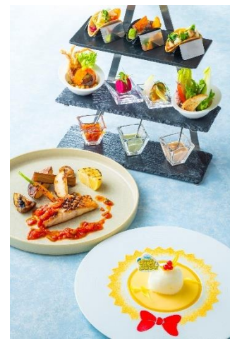
Disney Ambassador Hotel Disney Pal-Palooza “Donald’s Quacky Duck! Duck! Duck City!” Empire Grill Lunch

Guests can enjoy an even livelier and more festive Duck City, the wacky world that Donald dreamed up, at the Disney hotels.