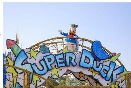
“Quacky Celebration ★ Donald the Legend!”

“Quacky Celebration ★ Donald the Legend!” is a parade where Disney friends celebrate Donald and enjoy a festive atmosphere together with guests in the whimsical world of Donald’s dreams. This year, the parade will be even livelier with the addition of “Quacky Ducks” on the parade floats. Pete, who made his debut at Tokyo Disney Resort in this parade last year, will now take on the role of celebration leader. Leading the way, Pete will guide Donald’s float as it arrives at the Castle Forecourt, where the praise for Donald will reach its peak, and everyone will celebrate the King of Superstars.