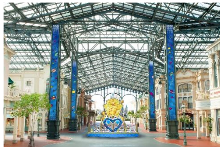
Monument in World Bazaar