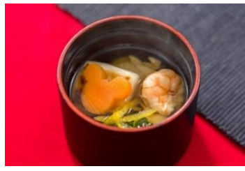
Mochi and Chicken in Broth (Restaurant Hokusai) Set with Mochi and Chicken in Broth instead of Miso Soup: plus 400 yen