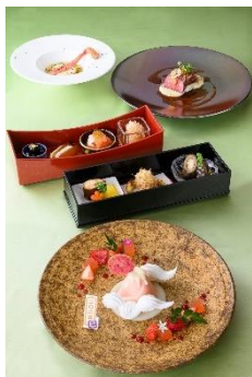
Tokyo Disneyland Hotel (Canna) “Year End & New Year Stylish Canna” 16,500 yen