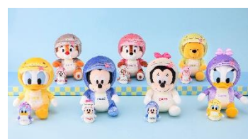
Plush Toy 3,400 yen each

© DISNEY Based on the "Winnie the Pooh" works by A.A. Milne and E.H. Shepard.