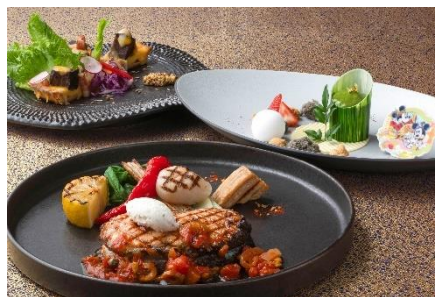
Disney Ambassador Hotel (Empire Grill) “Year End & New Year Empire Grill Dinner” 13,300 yen