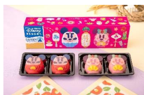
Daruma Sweets 1,500 yen