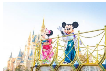
Concept image of New Year's celebrations at Tokyo Disney Resort

Note: Please see the attachment for details regarding the sales period of special merchandise and special menus.