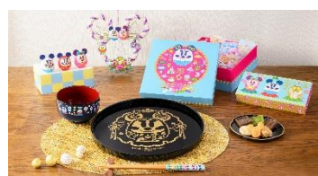
Figures 1,500 yen each New Year's Decoration 4,000 yen Bowl 1,300 yen Chopsticks Set 2,400 yen Tray 2,000 yen Rice Cracker 1,700 yen Chocolate 1,000 yen