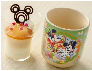
Kinako Mousse & Milk Jelly 550 yen With Souvenir Cup: plus 650 yen