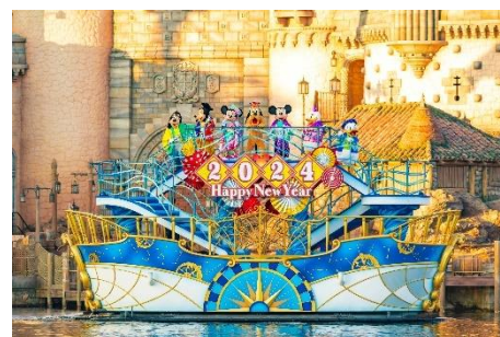
“New Year's Greeting” in 2024

From January 1 through 13, 2025, Mickey, Minnie and other Disney friends will be dressed in special New Year's outfits and appear aboard a boat adorned with festive decorations to share their New Year's greetings with guests.