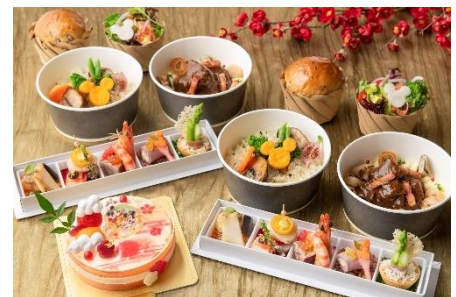
Disney Ambassador Hotel (Empire Grill) “Year End & New Year Dinner Set” 18,000 yen (for two persons)