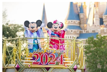
“New Year's Greeting” in 2024

From January 1 through 13, 2025, Mickey Mouse, Minnie Mouse and other Disney friends dressed in traditional Japanese outfits will appear on festive floats decorated for the New Year's season and celebrate the beginning of the new year with guests.