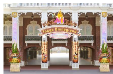
Concept image of New Year's decorations at the entrance to World Bazaar

From December 28, the entrance to World Bazaar in Tokyo Disneyland will be adorned with New Year's kadomatsu decorations featuring Mickey wearing a Japanese outfit. Kadomatsu decorations with designs of Mickey and Minnie will also be displayed at the entrance to Passaggio MiraCosta in Tokyo DisneySea, immersing guests in the festive atmosphere.