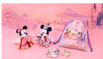
Plush Badge 2,500 yen each Button 500 yen Pin 1,200 yen Pouch 900 yen

Additionally, plush toys and plush badges featuring Disney friends dressed as a snake, the Chinese Zodiac animal of 2025, will be available from November 14.