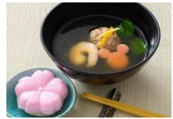
Mochi and Minced Duck Meat in Broth (Restaurant Sakura) Set with Mochi and Minced Duck Meat in Broth instead of Miso Soup: plus 700 yen

Note: Special merchandise and menu items are subject to change without notice and are only available while stocks last.