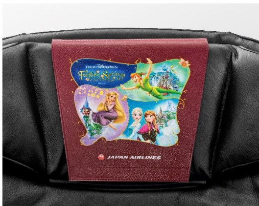
Headrest cover (red) - Available on Class J seats