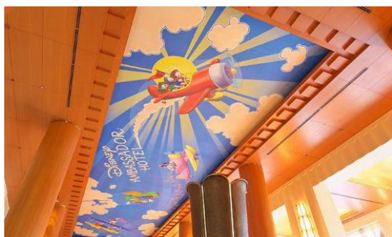
Mural (ceiling painting)

Disney Ambassador Hotel is filled with motifs of Disney characters in various areas throughout the hotel, including the vaulted ceiling of the main entrance lobby featuring a mural of Disney friends operating an airplane from the 1930s, which is the historical setting of the hotel, as well as a golden statue of Mickey as a movie director standing together with Pluto at the center of the lobby.