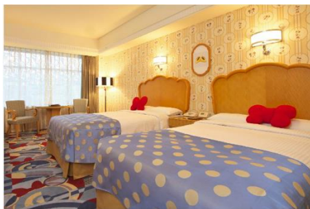
Minnie Mouse Room

Minnie Mouse motifs can be found all over this room, from the beds to the carpet and even the wallpaper, which features Minnie in a variety of poses. Additionally, guests will receive a special pouch inspired by the decor of the room.