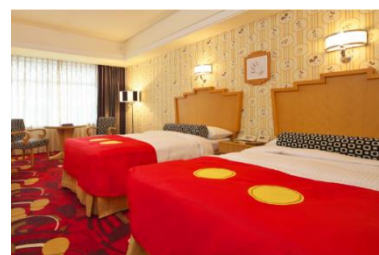
Mickey Mouse Room

This room is packed with motifs of Mickey Mouse, from the bed throws designed like Mickey's trademark red pants and yellow buttons to the wallpaper with Mickey depicted in various poses. The carpet is patterned with footprints to make it look like Mickey has walked around the room.