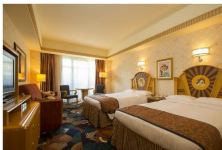
Chip 'n Dale Room