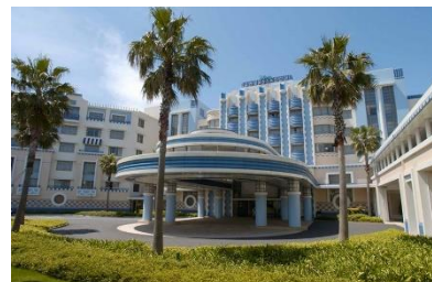
Disney Ambassador Hotel (exterior)

This Disney Hotel surrounds guests in the magical fun of Disney characters and offers easy access to both parks. From the lobby and restaurants to the guest rooms, motifs of Disney characters are sprinkled throughout the hotel. Guests can enjoy a comfortable stay at Tokyo Disney Resort in this hotel.