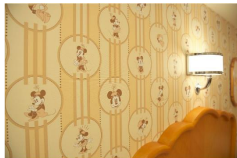
Minnie Mouse Room Wallpaper