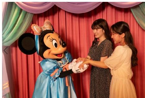
Greeting with Minnie Mouse

The pajama party includes a dessert plate that comes with decaffeinated tea, which guests can enjoy while waiting for the character greeting. This plate features confectioneries based on Minnie's bow, as well as other adorable items such as donuts and macarons in pastel hues.