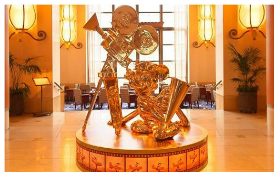
Golden statue of Mickey Mouse and Pluto