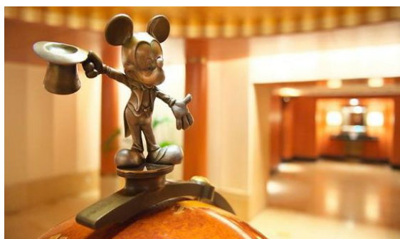
Globe in front of the elevator hall