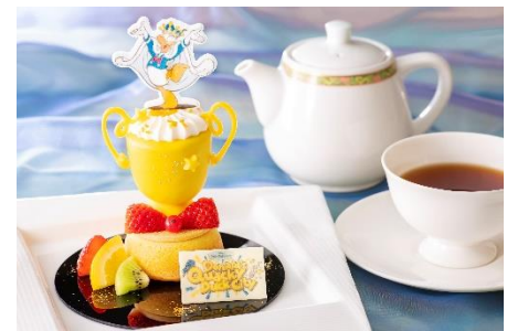
Hyperion Lounge Disney Pal-Palooza "Donald's Quacky Duck City" Cake Set 2,500 yen