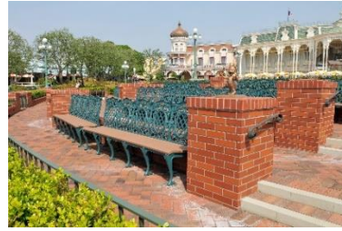
Vacation Package Exclusive Viewing Seats Plaza Garden