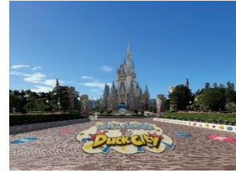
Scenery of Duck City (Plaza)