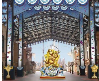
Monument in World Bazaar