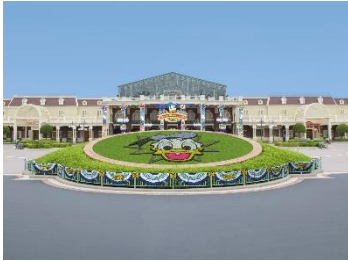
Donald flower bed at the Park Entrance

A one-of-a-kind and whimsically chaotic world awaits guests who enter Donald's "Duck City," where they will be greeted by a Donald Flower Bed and a grand Donald marquee. At the center of World Bazaar, a monument dedicated to Donald, now a superstar, stands tall. And wherever guests look, they will encounter unique "Duck City"-inspired decorations that add a playful and distinctive touch to the surroundings.