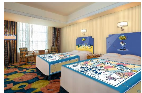
Disney Pal-Palooza "Donald's Quacky Duck City" Special Room

Note: Special menus at Tokyo Disneyland Hotel will be served from April 1, 2024, while the special menus at Disney Ambassador Hotel will be served from April 8, 2024.