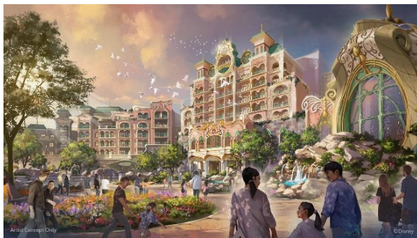
Exterior view of Grand Chateau from inside the Park

Details were also announced regarding Tokyo DisneySea Fantasy Springs Hotel guest rooms, restaurants, other hotel facilities and guest benefits, including purchasing privileges for the 1-Day Passport: Fantasy Springs Magic Park ticket, which allows guests to access Fantasy Springs anytime for the duration of their stay during the Park's operating hours, and experience the attractions in the new themed port with a reduced wait time, and without specifying the time in advance.