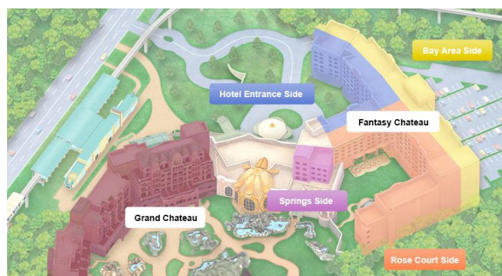
Guest room locations (Concept image)

Rooms with a view facing Fantasy Springs.