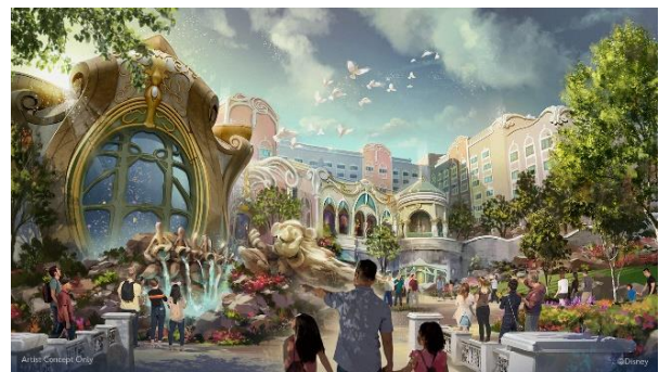
Exterior view of Fantasy Chateau from inside the Park

Situated near the magical springs in Fantasy Springs, the hotel offers an immersive accommodation experience where guests can enjoy the atmosphere of the Park with springs embedded with Disney characters created by its magical waters in the main entrance and the courtyard.