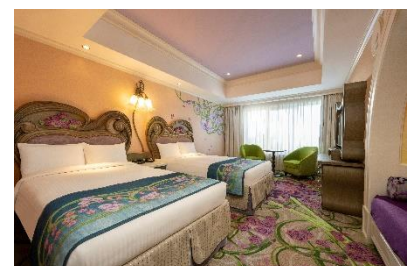
Example of a Guest Room in Fantasy Chateau

Fantasy Chateau's 419 guest rooms feature decorations with characters such as Rapunzel and Bambi from the stories of Walt Disney Animation Studios, and are filled with floral motifs including the wallpaper to room lighting. The guest rooms are available in four different location categories: Bay Area Side, Hotel Entrance Side, Rose Court Side, and Springs Side.