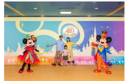
Commemorative photo with Disney friends in 40th anniversary outfits

Additionally, the "Enjoy Both Parks for 2 Days / 3 Days" plan allows guests to enjoy entertainment programs such as the daytime parade "Disney Harmony in Color," as well as popular attractions and Disney Character Greeting venues. Other packages such as the "Tokyo Disney Resort 40th Anniversary: Enjoy Attractions, Shows, and Character Greetings for 2 Days" plan and the "Tokyo Disney Resort 40th Anniversary: Enjoy Lunch at Magellan's and Character Greetings for 2 Days" plan, allow guests to experience special moments exclusive to Vacation Packages and include photo opportunities with Disney friends dressed in 40th anniversary fashions and more.