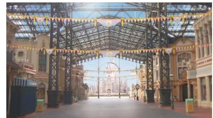
“Dream Garlands” at World Bazaar, Tokyo Disneyland

Disney Hotels will also welcome guests with 40th anniversary decorations, programs and exclusive items. On the Disney Resort Line, themed trains commemorating the 40th anniversary will be in operation, allowing guests to enjoy the ambience of “Dream-Go-Round” throughout Tokyo Disney Resort.