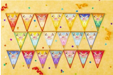
“Dream Garland” varieties

Note: The release date of Duffy and Friends’ special merchandise will be announced on the Duffy and Friends Official Twitter Page, https://twitter.com/withduffy_tds (in Japanese only), as soon as it is confirmed.