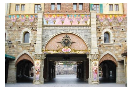
“Dream Garlands” at Tokyo DisneySea

Additionally, the entrance to Passaggio MiraCosta at Tokyo DisneySea and the pedestrian deck leading to Tokyo Disneyland will be adorned with festive decorations to celebrate the 40th anniversary.