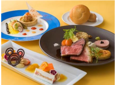
Special Course 7,000 yen

Additionally, Ice Cream Cones will offer a special sundae featuring soft-serve ice cream, berry sauce, peach sauce and cheese cream, topped with marzipan featuring the 40th anniversary logo. The delicious combination of cheese cream and fruity sauces makes the sundae all the more refreshing.