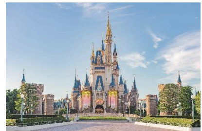
Decorations adorning Cinderella Castle at Tokyo Disneyland

Cinderella Castle, which has welcomed guests as the symbol of Tokyo Disneyland for 40 years, will be decorated with the commemorative number “40.” After dark, guests can enjoy seeing the banners around the castle glow — as if sprinkled by pixie dust.