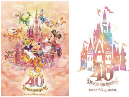
Designs featured in special merchandise

Additionally, the “Dream Garland” will be offered, allowing guests to enjoy the festive atmosphere of the 40th anniversary both at the Parks and at home. Guests can choose their favorite color and wear it around the Parks as an accessory with their family or friends, or decorate their homes by connecting multiple garland pieces. Guests will be able to enjoy the festive atmosphere of the 40th anniversary both at the Parks and at home. Furthermore, bag charms will also be available to add a touch of glamor to the “Dream Garland.” Guests can customize it however they like and attach it to their bag.