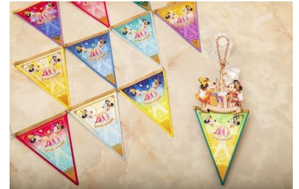
Example of how to customize Bag Charms

Packages that include the option to book restaurants at the Parks will give guests the opportunity to enjoy special 40th anniversary menu items. A "Beverage Ticket" will be offered, which allows guests to order unlimited eligible soft drinks, including the new 40th anniversary special drinks, at participating Park locations. In addition, guests will be able to select a special anniversary merchandise item to take home, such as a pink gold-toned bag charm with a design featuring Mickey Mouse and Minnie Mouse celebrating the anniversary.