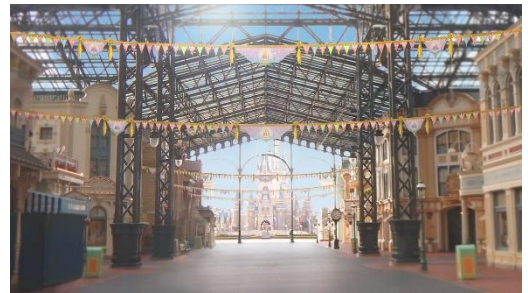
“Dream Garlands” at World Bazaar, Tokyo Disneyland

Main Street of World Bazaar at Tokyo Disneyland will welcome guests with multiple layers of colorful “Dream Garlands.” The beautiful presence of the “Dream Garland,” which will be displayed throughout Tokyo Disneyland and Tokyo DisneySea, will emphasize the connection between each area of the Parks.