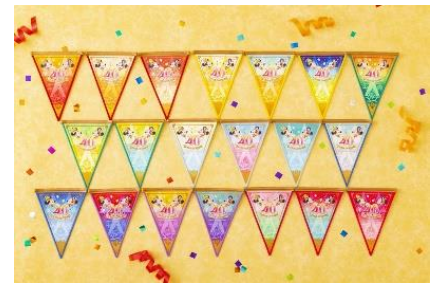
“Dream Garland” Special Merchandise

Adding to the excitement is the “Dream Garland,” a special decoration and symbol embodying the 40th anniversary theme, which will be found across the Parks. It represents the notion that guests, cast members and Disney friends are connected, like pieces of a garland, and will celebrate the 40th anniversary together in grand fashion. Cast members will wear colorful name-tag accessories depicting the garland as they welcome guests to the Parks. “Dream Garland” pieces will also be available as special merchandise. Guests can enjoy the 40th anniversary event both at the Parks and at home by wearing them as accessories or by collecting and connecting the colorful garland pieces to decorate their rooms. “Dream Garlands” will be displayed throughout the Parks, adding a festive touch to the 40th anniversary celebrations.