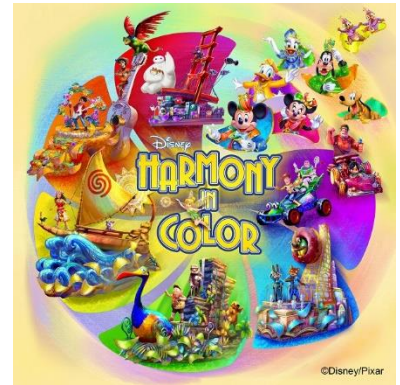
“Disney Harmony in Color”

Tokyo Disneyland is launching a brand-new daytime parade, “Disney Harmony in Color.” Themed to a “harmonious world of colors,” the parade showcases themes of adventure, courage, family bonds and friendship through various stories from Disney and Pixar films. The finale features a magnificent float that will take guests on a journey to a harmonious world of vibrant colors that is filled with dreams. Mickey Mouse and many other well-known Disney friends, including characters from Walt Disney Animation Studios’ Zootopia and Pixar’s Coco , will also make an appearance.