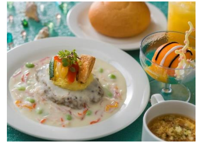
Special Set 2,680 yen

At Horizon Bay Restaurant in Port Discovery, menu items inspired by the Aquatopia attraction will be offered. The “Meat Patty with Yuzu Pepper Cream Sauce, Aquatopia Style” features a meat patty resembling the vehicles from the attraction and the yuzu pepper cream sauce, consisting of seaweed-inspired ingredients, represents the surface of the water. Furthermore, coral reefs provide the inspiration for the dessert included in the Special Set. It consists of blue jelly that represents the sea, passion fruit mousse with orange as a fish, and is topped with coral-shaped chocolate.