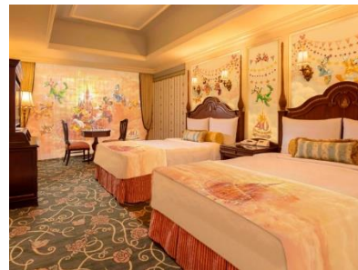
Tokyo Disneyland Hotel Tokyo Disney Resort 40th “Dream-Go-Round” Special Room

- Example of postcard available at Tokyo Disneyland Hotel, Disney Ambassador Hotel and Tokyo DisneySea Hotel MiraCosta.