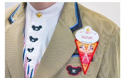
Name tag with 40th anniversary design and name tag accessory featuring the “Dream Garland”

Cast members will wear name tags with 40th Anniversary designs and “Dream Garlands” in various colors as name tag accessories. Even more color will be added to the celebration with “ Dream-Go-Round Time! ,” in which cast members and guests celebrate the 40th anniversary with the theme song in various areas of the Parks. Additionally, cast members will hand out “Dream Garland Stickers” to guests who would like one. Cast members and guests alike will be able to connect by wearing a “Dream Garland” piece or “Dream Garland Sticker” and celebrate this special year together.