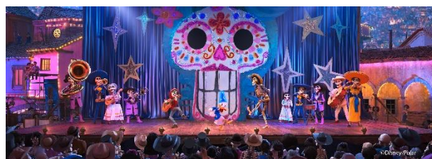
Images from the Disney and Pixar film Coco added to Mickey's PhilharMagic

Note: Due to renovation, Mickey's PhilharMagic is temporarily closed from July 4.