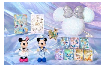
Merchandise themed to the 20th anniversary