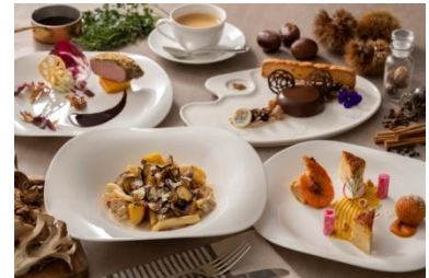
Concept image of menu items for the Seasonal Taste Selections program

With the Seasonal Taste Selections program, select restaurants in the Park will be given a common theme perfect for the season. Guests can enjoy menu items based on the theme, that will highlight the chefs' skills and showcase the unique characteristics of each restaurant. Also at the Park, the ever-popular churros will be available in a 20th anniversary special version and a special drink can be enjoyed as well. In addition, lunch cases, cups and other food souvenir items featuring the 20th anniversary designs and those themed to Duffy and Friends will be offered.