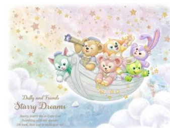
Concept image for “Duffy and Friends Starry Dreams” merchandise