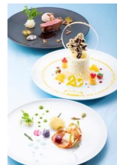
Concept image for special menu items at Oceano, Tokyo DisneySea Hotel MiraCosta

banquet rooms will offer special menu items for a limited period for guests booking the Private Dining Plan, the hotel's original dining plan exclusively for parties of six or more.