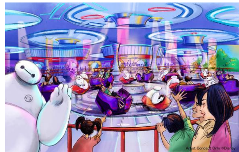
The Happy Ride with Baymax

The brilliant young inventor Hiro Hamada learned from his robotic personal healthcare companion Baymax that the first step in making people healthy is to make them happy, so he and Baymax developed this wild, musical ride that is sure to make everyone happy.