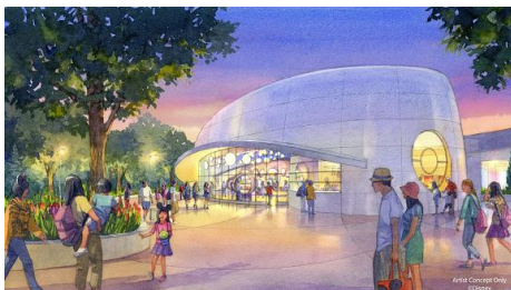
Exterior of The Big Pop

The Big Pop offers a variety of popcorn buckets that can be filled with a choice of three flavors of popcorn: Cookie & Cream, available for the first time at the Park, Caramel & Cheese and Strawberry Milk. The mushroom-type popcorn offered here is aromatic and hearty.