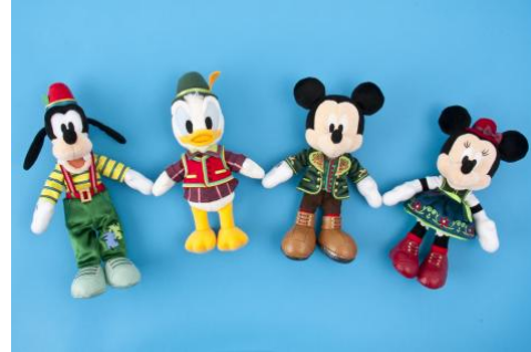
Plush Badge 2,300 yen each

Note: Special merchandise will be available at Grand Emporium starting from April 8, 2020 and at Village Shoppes from April 15, 2020. Merchandise content may change without notice and items will only be available while supplies last.