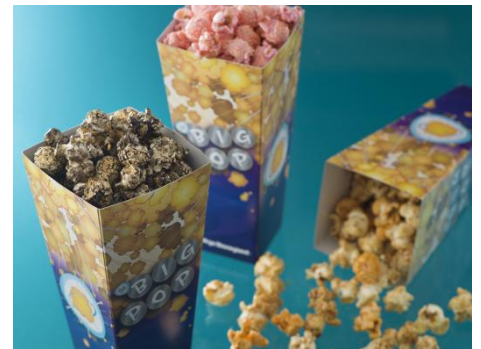
Three popcorn flavors