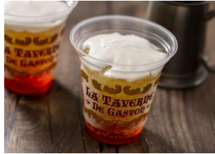
Berry Cheers 450 yen/cup