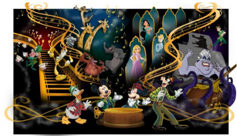
"Mickey's Magical Music World" concept image

Disney Characters: Mickey Mouse, Minnie Mouse, Donald Duck, Goofy, Snow White, Pinocchio, Jiminy Cricket, Woody, Jessie, Lumiere, Belle, Alice, Mary Poppins, Baloo, King Louie, Timon, Cinderella, Jasmine, Rapunzel, Peter Pan, Captain Hook, Mr. Smee, and others