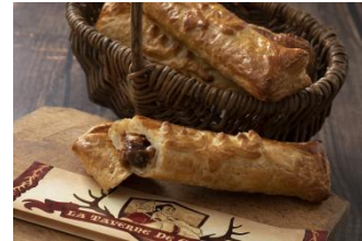
Hunter's Pie Set: 1,140 yen Pie only: 750 yen