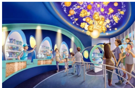
Interior of The Big Pop