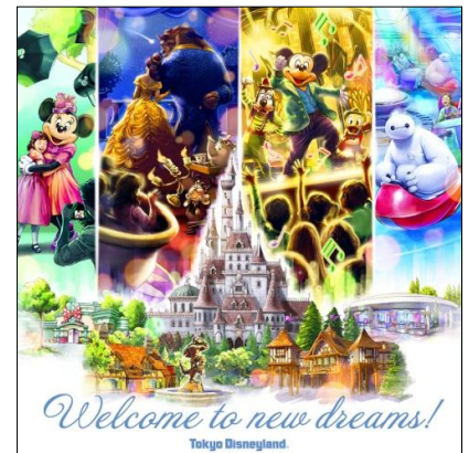
Concept image of the facilities opening on April 15, 2020

URAYASU, CHIBA — Oriental Land Co., Ltd. has announced new details for the expansions coming to Fantasyland, Toontown and Tomorrowland on April 15, 2020, as part of the largest expansion since Tokyo Disneyland® Park opened. The details include descriptions of attractions, theater entertainment, merchandise and menus that will allow guests to feel like they have entered a Disney film as they meet their favorite Disney Characters and listen to well-known music. This new experience will immerse guests in the world of Disney like never before.