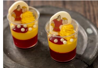
Sweet Gaston 450 yen each

Note: Sets include French Fries and Soft Drink.