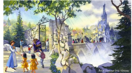
Exterior of Beauty and the Beast Castle

Will Belle and the Beast find love and thus break the spell before the last petal of the enchanted rose falls? Guests can look forward to the magical romance of Enchanted Tale of Beauty and the Beast.