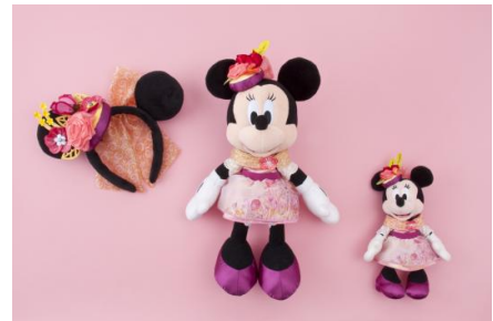
Hairband 1,800 yen, Plush toy 5,100 yen, Plush badge 2,300 yen

Note: Special merchandise will be available at Gag Factory/Toontown Five and Dime starting from April 8, 2020. Merchandise content may change without notice and items will only be available while supplies last.