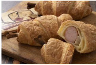
Big Bite Croissant Set: 1,140 yen Croissant only: 750 yen