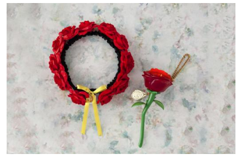
(Left) Hairband 2,100 yen (Right) Melody Light Rose 2,300 yen

Note: Special merchandise will be available at Grand Emporium starting from April 8, 2020 and at Village Shoppes from April 15, 2020. Merchandise content may change without notice and items will only be available while supplies last.