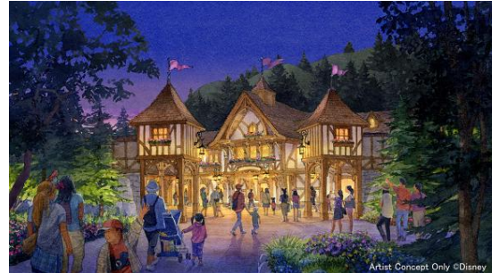
Fantasyland Forest Theatre exterior