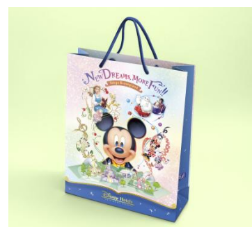
Paper gift bag for Tokyo Disneyland Hotel and Disney Ambassador Hotel

Tokyo Disneyland® Hotel, Disney Ambassador® Hotel and Tokyo Disney Celebration Hotel® will welcome guests with various programs starting from April 8, 2020 and continuing through March 19, 2021. The lobby and other areas of these three Disney hotels will feature decorations commemorating the opening of Tokyo Disneyland's new attractions and facilities.