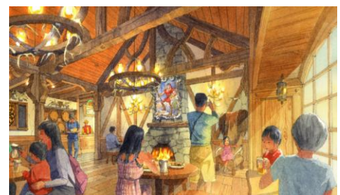
Interior of La Taverne de Gaston

The interior of the tavern proudly displays trophies celebrating Gaston’s many accomplishments. There’s even the large portrait of Gaston above the fireplace as seen in the film.