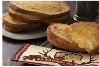
French Toast Sandwich Set: 1,140 yen Sandwich only: 750 yen