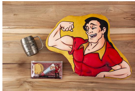
(Top left) Stainless Mug 2,600 yen (Bottom left) Toothbrush Set 1,700 yen (Right) Cushion 2,300 yen