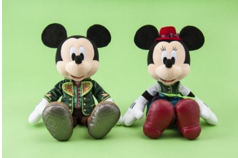
Plush Toy 5,100 yen each

Around 15 different types of plush toys and plush badges of Mickey Mouse and his Pals wearing costumes like the ones they wear in “Mickey’s Magical Music World” will be available.