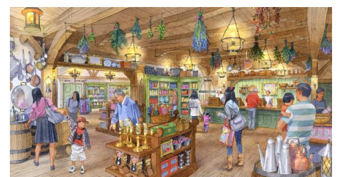
Interior of Village Shoppes

Inspired by the shops in Disney’s Beauty and the Beast and filled with ornamentation and other details created by the artisans of the little village where Belle lives, Village Shoppes consists of La Belle Librairie , Little Town Traders and Bonjour Gifts . This trio of shops provides a delightful, one-of-a-kind shopping experience.