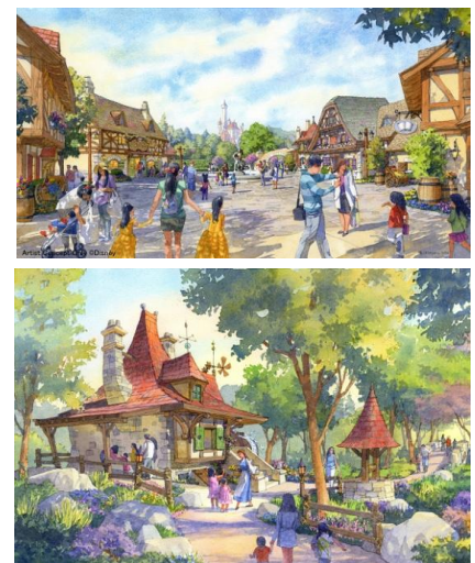
Area themed to Disney’s Beauty and the Beast

This area stretches from the village where Belle lives to the forest where the Beast’s castle is secluded. At the entrance to the village is the home of Belle’s father: Maurice’s Cottage (Disney FASTPASS® machines are located here). Inspired by the film, a fountain dedicated to Gaston can be found at the center of the village. La Taverne de Gaston restaurant and Village Shoppes , including one themed to the bookstore that Belle frequents, line the street. With music from the film playing, guests will feel as though they have stepped right into Belle’s world. Leaving the village behind, guests enter the forest where Beauty and the Beast Castle looms. Inside the castle, guests can experience Enchanted Tale of Beauty and the Beast attraction.