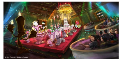
Scene from the Enchanted Tale of Beauty and the Beast attraction