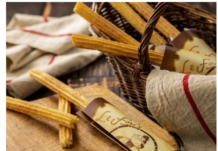
LeFou's Churro (Apple-Caramel) 400 yen each

Note: Menu items are subject to change without notice and only available while supplies last.