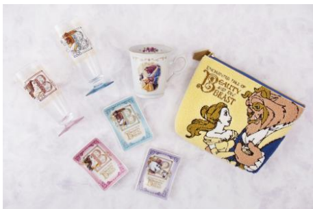
(Top left, 2 items) Glass Set 2,600 yen (Top center) Mug 1,500 yen (Bottom center, 3 items) Plate Set 2,900 yen (Right) Pouch 3,000 yen

The shops will offer around 100 different types of special merchandise that will enhance the ambience from the Beauty and the Beast film. Mugs and dishes with romantic designs featuring Beauty and the Beast Castle or Belle dancing with the Beast, as well as playful items like eyeglass stands and cushions with designs of the strong and handsome Gaston, will be available. Merchandise with motifs of the enchanted rose from the story will also be available, including the Melody Light Rose, a toy that emits light and sound.