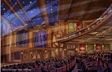
Fantasyland Forest Theatre interior