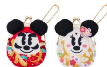
Coin Case Set 2,000 yen