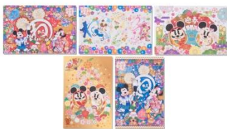
New Year’s Cards Set 630 yen

Approximately 60 different types of merchandise for New Year’s will be available. Some items feature Mickey Mouse writing the Japanese letter for the zodiac character of the year and other items depict the Disney friends in traditional Japanese attire. There will also be daruma (Japanese good luck doll) based on Mickey Mouse and Minnie Mouse.