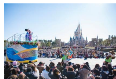
“New Year's Greeting” in 2019

Outline: Mickey Mouse and Minnie Mouse dressed in kimono will appear with other Disney friends on floats decorated for the New Year season.