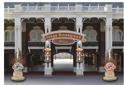
New Year’s decorations at entrance to World Bazaar at Tokyo Disneyland

At the entrance to World Bazaar in Tokyo Disneyland, the traditional New Year’s kadomatsu decorations will feature Mickey Mouse and Minnie Mouse. The kadomatsu decorations at the entrance to Passaggio MiraCosta in Tokyo DisneySea will also be themed and banners decorating the passageway will depict kimono-clad Mickey Mouse and Minnie Mouse.