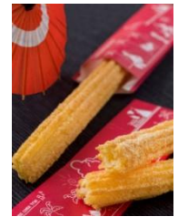
Kinako Churro 400 yen