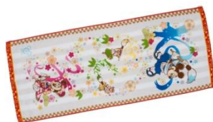
Hand Towel 1,500 yen