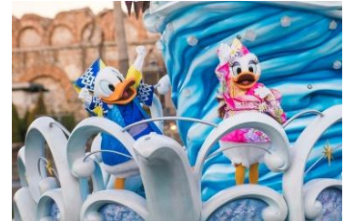
“New Year’s Greeting” in 2018

Location: Mediterranean Harbor Performances: 3 daily Duration: About 10 minutes Performers: 6 Outline: Mickey Mouse, Minnie Mouse and their friends, dressed in special New Year’s costumes, will appear aboard a barge on the waters of Mediterranean Harbor to share their New Year’s greetings with Guests.