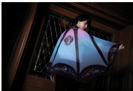
Cape 2,500 yen

Special merchandise will go on sale from September 2, 2019.