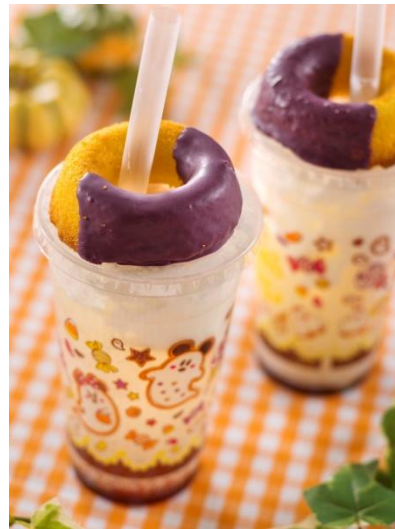
Popcorn Soda & Doughnut 600 yen at Boiler Room Bites and Captain Hook's Galley

Special merchandise and menu items are subject to change without notice and only available while stocks last.