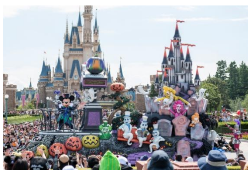
“Spooky ‘Boo!’ Parade” at Tokyo Disneyland