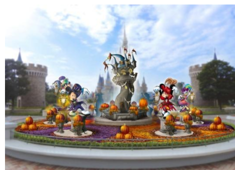
Decorations at the Plaza in front of Cinderella Castle

The atmosphere of a “ghost version of Tokyo Disneyland” is created through decorations of unique and humorous ghosts for Disney Halloween. At the Plaza in front of Cinderella Castle, Guests can enjoy decorations depicting the Disney Friends joining the Halloween ghosts. In addition, photo locations will be set up where Guests can take pictures with Halloween ghosts. After dark, World Bazaar is offering a nighttime presentation in an exclusive Halloween version during Disney Halloween.