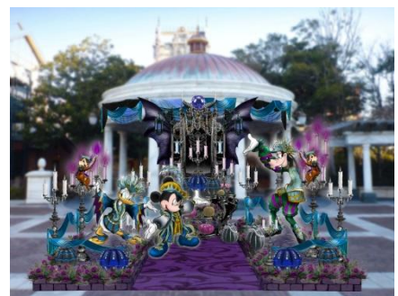
Decorations at Waterfront Park

Mediterranean Harbor will feature a darker color palette inspired by this year’s concept, and a photo location of the Disney Friends can be experienced in Waterfront Park at American Waterfront.