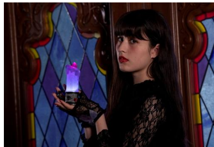
Lace Gloves 1,200 yen Light-up Item 1,700 yen