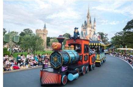
“Spooky ‘Boo!’ Parade” at Tokyo Disneyland

In this parade of Halloween chills and thrills, the ghosts have invited the Disney Friends to enjoy a ghostly version of Tokyo Disneyland. The Disney Friends make their appearance on floats that are inspired by various attractions and themed lands, but with an eerie transformation. There is a Western River Railroad locomotive operated by a skeleton, as well as jack-o’-lanterns featuring the ghosts. As everyone begins to have fun in the ghost-version Tokyo Disneyland, the Disney Friends undergo a spooky transformation, costumes and all! This year, Mickey Mouse and Minnie Mouse will be dressed in new colorful costumes. The ghosts are happy to welcome their new “ghost” friends and together with new “ghost” dancers heat up the celebratory atmosphere.