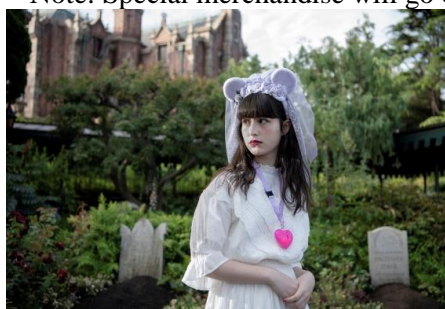
Headband 1,800 yen Light-up pendant 1,500 yen

Note: Special merchandise will go on sale from September 2, 2019.