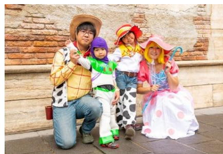
Guests dressed up in costumes

When mentioning that Guests can enter the Park in costume, please include the information in the box below, or include the following note: "For details on the restrictions for visiting Tokyo Disneyland and Tokyo DisneySea in full Disney Character costumes, please check the Tokyo Disney Resort Official Website or contact the Tokyo Disney Resort Information Center."