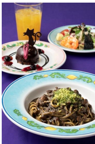
Special Set 1,880 yen at Cafe Portofino

Special menu items will go on sale from September 2, 2019.