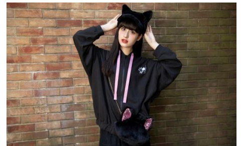
Cap 2,800 yen Hooded Sweatshirt (for Women, Size: S, M) 4,900 yen each Pochette 2,000 yen