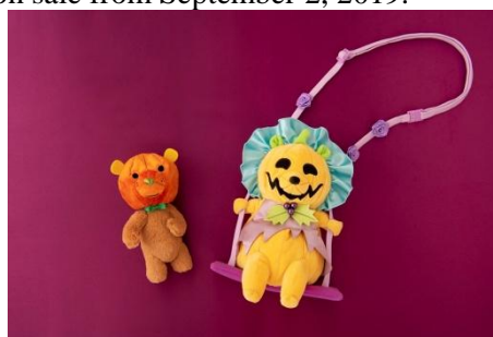
Plush Badge 1,800 yen Pochette 2,300 yen