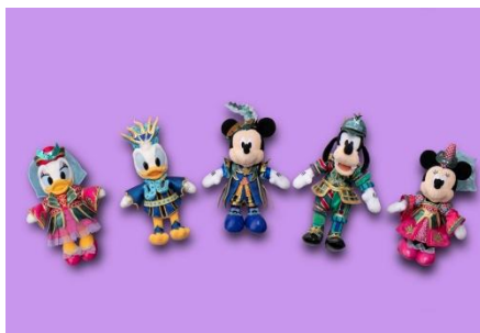
Plush Badges 1,900 yen each