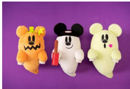
Plush toy 1,700 yen each