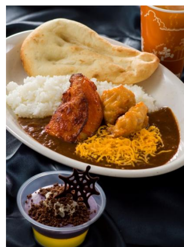
Special Set 1,580 yen at Casbah Food Court

Special merchandise and menu items are subject to change without notice and only available while stocks last.