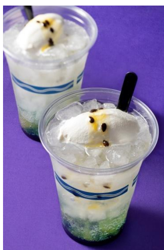
Wine Cocktail (Cassis & Passion Fruit) 680 yen at Cafe Portofino