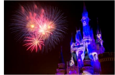
Night High Halloween

Spectacular fireworks will go up at both Tokyo Disneyland and Tokyo DisneySea, to music inspired by Halloween.