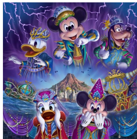
“Disney Halloween” at Tokyo DisneySea

*Please include the following when referring to wearing costumes in Tokyo Disneyland or Tokyo DisneySea: For details on the restrictions for visiting Tokyo Disneyland and Tokyo DisneySea in full Disney character costumes, please check the Tokyo Disney Resort Official Website or contact the Tokyo Disney Resort Information Center.