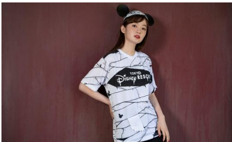
T-shirt (Size: M, L) 2,800 yen each Mickey hat 2,000 yen

Note: Special merchandise will go on sale from September 2, 2019.