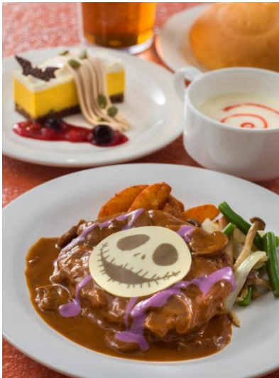
Special Set 1,940 yen at Plaza Pavilion Restaurant

Note: Special menu items will go on sale from September 2, 2019.