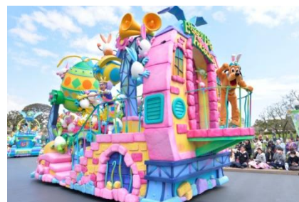
"Usatama on the Run!" at Tokyo Disneyland

One day when everyone was busy getting ready for Easter, lots of “usatama” were unexpectedly created from Easter eggs. They soon escaped into the Park, causing a big commotion. In the parade, Mickey Mouse and his Friends dressed as “usatama chasers” use oversized vacuum cleaners and “usatama” detectors to find the “usatama” characters.