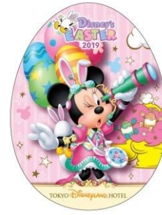
Postcard for Guests staying at Tokyo Disneyland Hotel