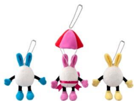
Strap set 1,800 yen

At Tokyo Disneyland, around 60 types of special items will be available with designs of the “usatama” characters and of the Disney Friends dressed as “usatama chasers.” Guests can also find fun caps that can be worn to become one of the “usatama chasers.”