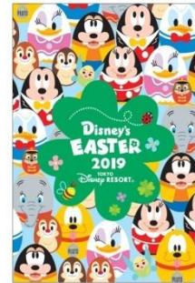
Postcard for Guests staying at Tokyo Disney Celebration Hotel