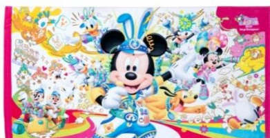
Bath Towel 3,400 yen