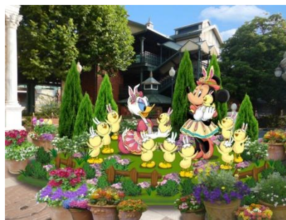
Decorations at American Waterfront