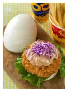
Special Set 990 yen at Huey, Dewey and Louie's Good Time Cafe

Guests can enjoy some Easter fun with “Egg Hunt Tasting” at Park restaurants offering a range of cute and colorful special menus using eggs as an ingredient or having an egg motif. Huey, Dewey and Louie's Good Time Cafe will offer a special menu which includes an egg and sausage cutlet sandwich on an egg-shaped bun. Grandma Sara's Kitchen will serve a special set which includes a main dish that looks like it is coming out of an egg and a dessert featuring an egg-shaped chocolate. Also available will be a dessert dish which includes a souvenir cup with a “usatama” design.