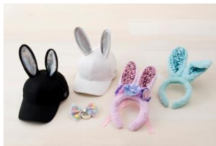
Cap 2,600 yen each Bunny Ears Headband 1,300 yen each Hair tie 700-900 yen

About 30 types of items that feature Easter egg designs with a Disney Character motif will also be available. In addition, about 30 types of items with designs of Miss Bunny, Thumper and more will be available including tableware, interior items, and other items for everyday use.