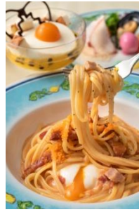
Special Set 1,880 yen at Cafe Portofino

Notes: Special menus will be available from March 26. The contents of the menus may change and some items will only be available while the supply lasts.