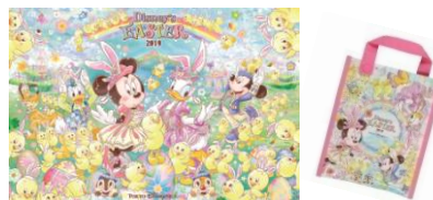
Picnic Sheet (with bag) 650 yen

Notes: Special merchandise will be available from April 1. Sales of some special merchandise will start April 22. Special merchandise items are available in limited numbers and may sell out.