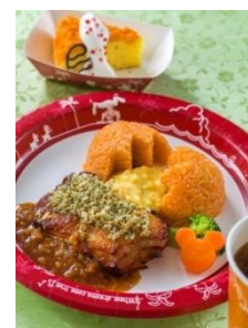
Special Set 1,580 yen at Grandma Sara's Kitchen

Notes: Special menus will be available from March 26. The contents of the menus may change and some items will only be available while the supply lasts.