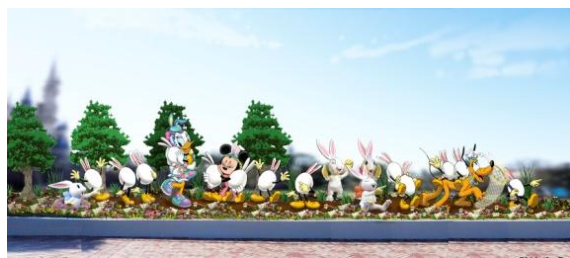
Decorations at The Plaza in front of Cinderella Castle