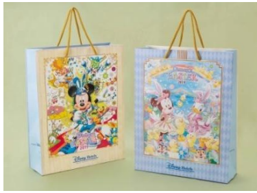
Paper Gift Bag for Guests staying at Disney Ambassador Hotel and Tokyo Disneyland Hotel