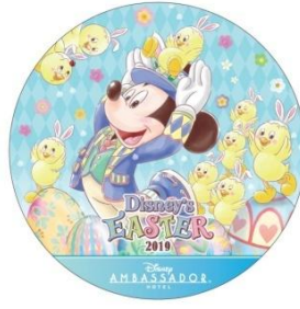
Postcard for Guests staying at Disney Ambassador Hotel