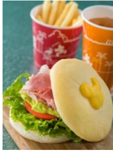
Special Set 1,230 yen at New York Deli