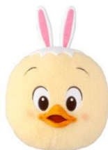
Cushion 2,600 yen