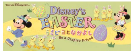
““Disney’s Easter’ Be a Usapiyo Friend” quiz sheet (front)

At Tokyo DisneySea, Guests can get to know the “usapiyos” better through the quiz sheet ““Disney’s Easter’ Be a Usapiyo Friend” (complimentary). Distributed inside the Park, this quiz sheet helps Guests learn more about the happy “usapiyos” and enjoy “Disney’s Easter” even more.