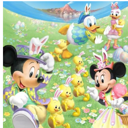
“Disney’s Easter” at Tokyo DisneySea

“ Disney’s Easter ” at Tokyo DisneySea this year will have a new theme and feature a new type of character called “ usapiyo* ”. The story behind the “ usapiyo ” characters is that they appeared when Mickey Mouse and his friends were getting ready for Easter. Minnie Mouse and Daisy Duck found a picture of a chick on some eggs and thought it would be cute to draw some bunny ears on them. To their surprise, little chicks wearing bunny ears hatched from those eggs. And that’s how the cute, innocent little “ usapiyos ” came to be, adding unique, whimsical fun to the event.