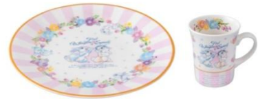
Plate 1,300 yen Mug 1,300 yen

Notes: Special merchandise will be available from April 1. Special merchandise items are available in limited numbers and may sell out.