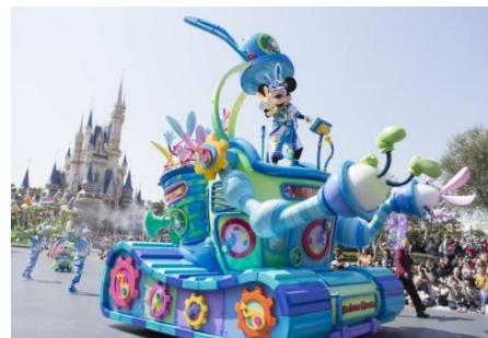
“Disney’s Easter” at Tokyo Disneyland

At Tokyo Disneyland , the bunny-eared, mischief-making egg characters, “ usatama** ,” will be back again after two years for the special event, “ Disney’s Easter. ” The Disney Friends were busy making Easter eggs in preparation for Easter when the “ usatama ” unexpectedly escaped into the Park creating pandemonium! Along the parade route the Disney Friends dressed as “ usatama chasers ” try to catch the runaway “ usatama ” in the fun and zany parade, “ Usatama on the Run! ” Around the Park, Guests will also find the “ usatama ” in decorations that show the runaways having a good time in