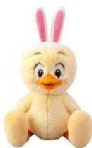
Plush Toy 2,900 yen

At Tokyo DisneySea, about 60 different types of merchandise designed with the “usapiyos” and the Disney Friends will be available. Fluffy “usapiyo” plush toys and cushions will be offered as well as towels and picnic sheets in springtime designs.