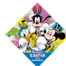
“Disney Easter” Search for ‘Usatama’” original sticker