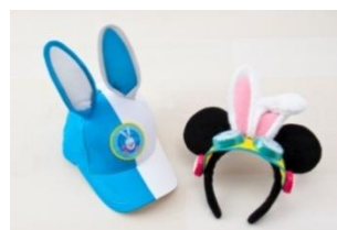
Fun cap 2,500 yen Headband 1,800 yen

Notes: Special merchandise will be available from April 1. Sales of some special merchandise will start April 22. Special merchandise items are available in limited numbers and may sell out.