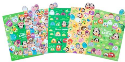
Clear folder set 1,100 yen