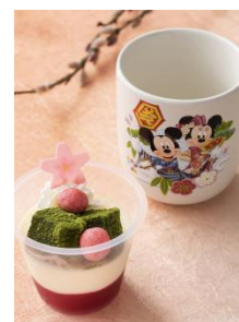
Sweetened Milk Mousse & Strawberry Jellied Dessert with Souvenir Cup 750 yen

Note: Special menus will be available from Dec. 26, 2018.