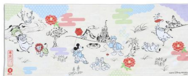
Towel 1,200 yen