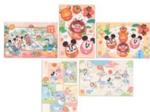
New Year's Cards Set 620 yen

Park shops will offer approximately 55 different types of New Year's merchandise. Some items will feature the Disney Friends dressed up in kimono. Other items will feature Pumbaa and Simba from the Disney film The Lion King . There will also be daruma (Japanese good luck doll) based on Pumbaa, Mickey Mouse and other Disney Characters.