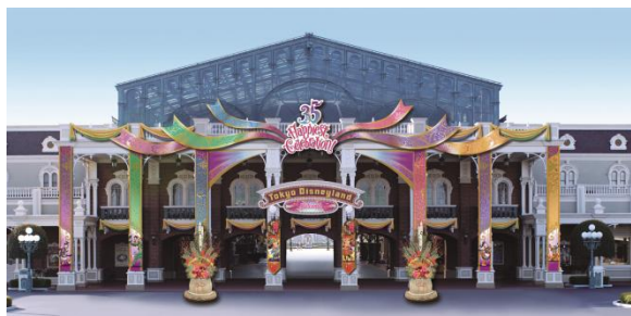
New Year's decorations at entrance to World Bazaar at Tokyo Disneyland

In celebration of the Year of the Boar, the traditional New Year's kadomatsu decoration will feature Pumbaa and will frame the entrance to World Bazaar in Tokyo Disneyland. The kadomatsu decoration at the entrance to Passaggio MiraCosta in Tokyo DisneySea will also feature Pumbaa. Depicted on the banners decorating the passageway will be Pumbaa and kimono-clad Mickey Mouse and other Disney Friends.