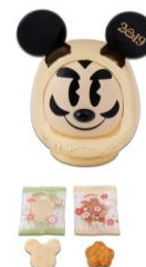
Senbei 1,600 yen

Note: Special merchandise will be available from Nov. 30, 2018.