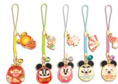
Netsuke Set 2,000 yen