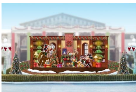
Photo location at the Main Entrance

From the towering Christmas tree in World Bazaar to the holiday decorations in each of the themed lands, including an interactive photo location, Guests will be immersed in a holiday atmosphere filled with fantasy throughout Tokyo Disneyland.