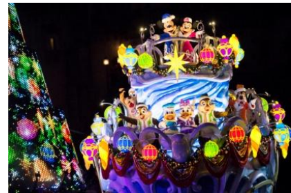
"Colors of Christmas" at Tokyo DisneySea

The Christmas tree and the floating illuminations sparkle even more as "snow" starts to fall and fountains shoot up high with lasers and pyrotechnics, creating a colorful atmosphere at Mediterranean Harbor for a spectacular finale.