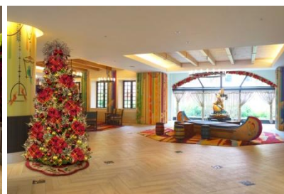
Christmas decorations at Tokyo Disney Celebration Hotel: Discover