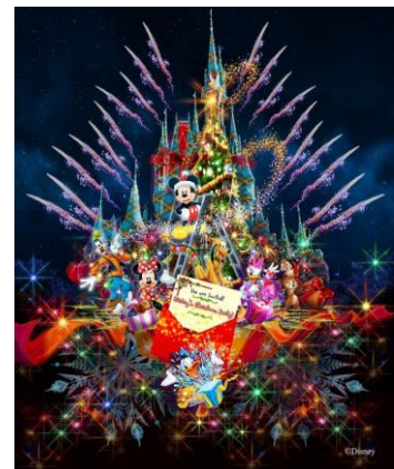
“Disney Gifts of Christmas” at Tokyo Disneyland

“ A Perfect Christmas ,” the daytime show at Mediterranean Harbor, will feature the Disney characters sharing their dreams of Christmas. A new scene with Daisy Duck