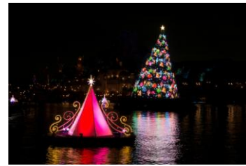
“Colors of Christmas: Afterglow” at Tokyo DisneySea

the Christmas atmosphere for the remainder of the evening after the fireworks spectacular. This year, the show will be presented with a new effect of snow falling all around the harbor, creating a romantic atmosphere.