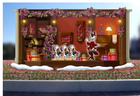
Photo locations in the Plaza in front of Cinderella Castle