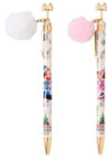
Ballpoint Pen Set 1,440 yen (Tokyo DisneySea)