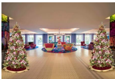
Christmas decorations at Tokyo Disney Celebration Hotel: Wish