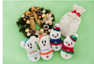
SnoSnow "Make It Mine" Basic Set 2,200 yen Parts 400 yen each (Tokyo Disneyland / Tokyo DisneySea)