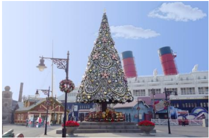
Christmas Tree in American Waterfront

Again this year, Lost River Delta will offer the Christmas illumination “ Fiesta de la Luz ” (Spanish for “festival of lights”). Guests can enjoy the red and green Central American-style decorations that create a cheerful Christmas atmosphere.