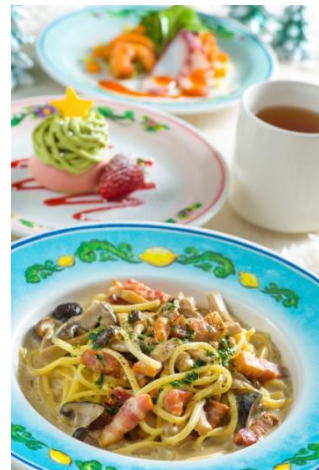
Special Set 2,180 yen at Cafe Portofino (Tokyo DisneySea)