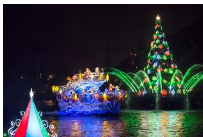
“Colors of Christmas” at Tokyo DisneySea

After dark, “ Colors of Christmas ” will be presented on the harbor waters, with a new effect of falling snow. The Disney characters, dressed in new costumes, will add their wishes to those of the Guests to light up the central Christmas tree on the harbor.