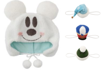
SnoSnow Fun Cap 2,000 yen Parts 600 yen each (Tokyo Disneyland / Tokyo DisneySea)