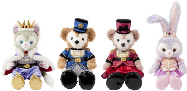
Costume Sets 4,800 yen each Plush toy (S-size) sold separately (Tokyo DisneySea)