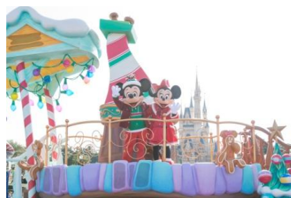
“Disney Christmas Stories” at Tokyo Disneyland

The parade stops in two locations for a Christmas party. Bells ring out as Christmas music plays and the Disney Characters together with the Guests make the party even livelier. In the finale, it begins to snow as the Guests and the Disney Characters celebrate a heartwarming Christmas together.