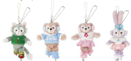
Straps 1,700 yen each (Tokyo DisneySea)