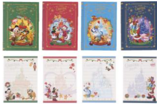
Memo Set 820 yen (Tokyo Disneyland)