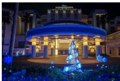
Christmas illuminations at Disney Ambassador Hotel

Tokyo Disney Celebration Hotel® , which consists of Tokyo Disney Celebration Hotel – Wish and Tokyo Disney Celebration Hotel – Discover, will feature Christmas decorations in the hotel interior for the first time since the opening of the hotel in 2016.