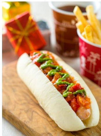
Special Set 900 yen at Refreshment Corner (Tokyo DisneySea)

Both Parks will offer a hot apple-based beverage that is both sweet and tart and