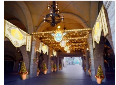
Decorations in Passaggio MiraCosta