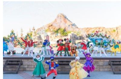
“A Perfect Christmas” at Tokyo DisneySea

In this entertainment program, Mickey Mouse and his Disney Friends share what they feel are the joys of Christmas, and of spending the holiday season with friends and family. This year, the show is presented with a new scene featuring Daisy Duck and Christmas confections. As the show begins, happy Christmas music fills the air, building a sense of anticipation. The Disney Friends share the joys of Christmas, including Christmas trees, music and other holiday delights that they express through song and dance.