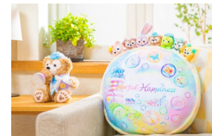
Products related to Duffy and Friends 20th anniversary