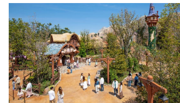
Areas within Fantasy Springs

*Operating cash flow = Profit attributable to owners of parent + Depreciation and amortization