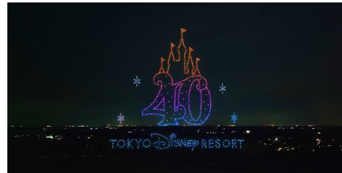
Special Drone Show

Notes: Parades and shows are subject to change due to weather conditions, etc. All photos are concept images. Plans announced as of July 28, 2023.