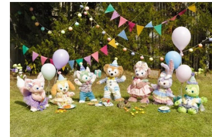
Duffy and Friends’ From All of Us [Tokyo DisneySea]

Attendance increased due to Tokyo Disney Resort 40th Anniversary events, sales of limited-period tickets and recovery of overseas Guests