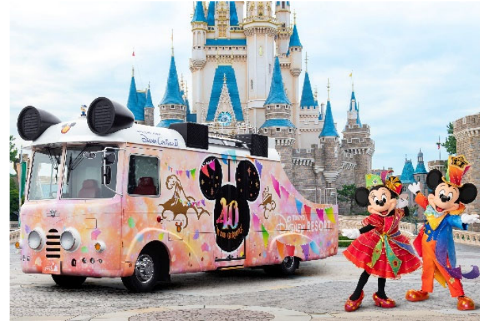
Special Parade ©Disney