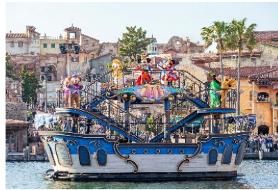
Harbor Greeting “Let's Celebrate with Colors” [Tokyo DisneySea®]