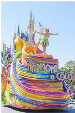
A new daytime parade “Disney Harmony in Color” [Tokyo Disneyland®]