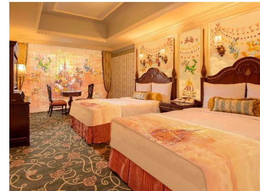
Tokyo Disney Resort 40th “Dream-Go-Round” special room [Tokyo Disneyland Hotel®]

Note: Increase in costs is expressed by figures in parentheses, which show by how much operating profit decreased.