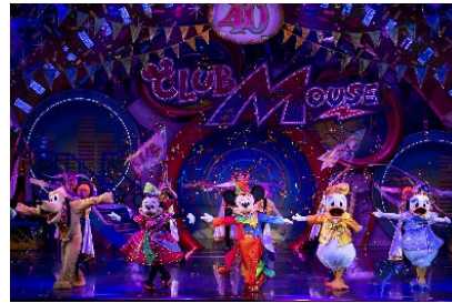
Club Mouse Beat [Tokyo Disneyland]