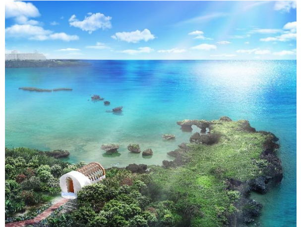
Aerial View of Seragaki Island Chapel (rendering)