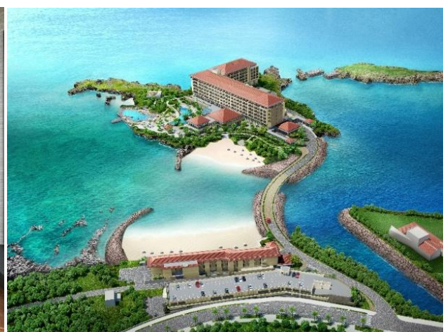
Aerial View of the Resort (rendering)