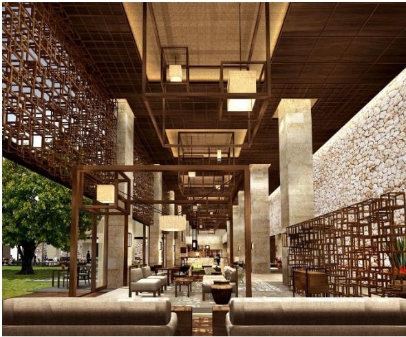
Lobby Lounge (rendering)

The opening team is committed to making Hyatt Regency Seragaki Island Okinawa a one-of-a-kind resort that drives travelers' decisions of where to vacation. The joint communiqué stated, "We are united in our desire to position Hyatt Regency Seragaki Island Okinawa as a premier luxury destination in the Asia-Pacific region. We aim to rewrite the definition of what a destination hotel can be."