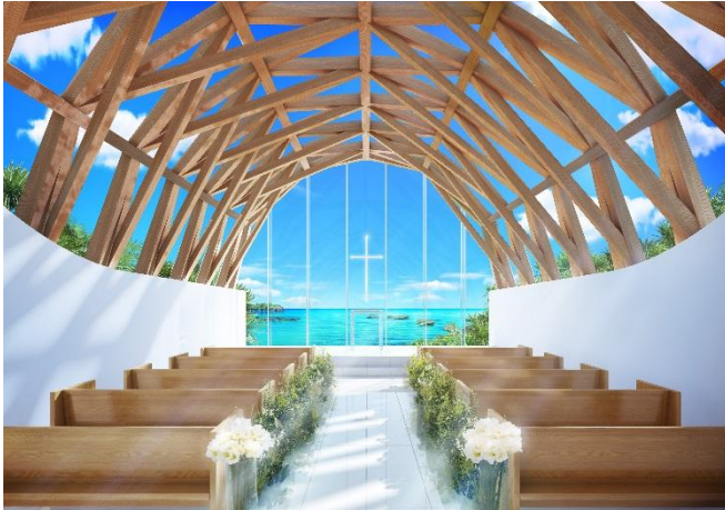
Seragaki Island Chapel (rendering)

Seragaki Hotel Management K.K. has entered into an agreement with Good Luck Corporation, who will oversee the resort's wedding-related products and services as well as the operation of the on-site chapel and wedding salon facilities. The consultancy's Arluis Wedding enterprise is recognized as a growth leader in Japan's destination weddings market. Prospective brides and grooms should note that reservations for Seragaki Island Chapel will commence December 22 for weddings scheduled September 1, 2018 or later.