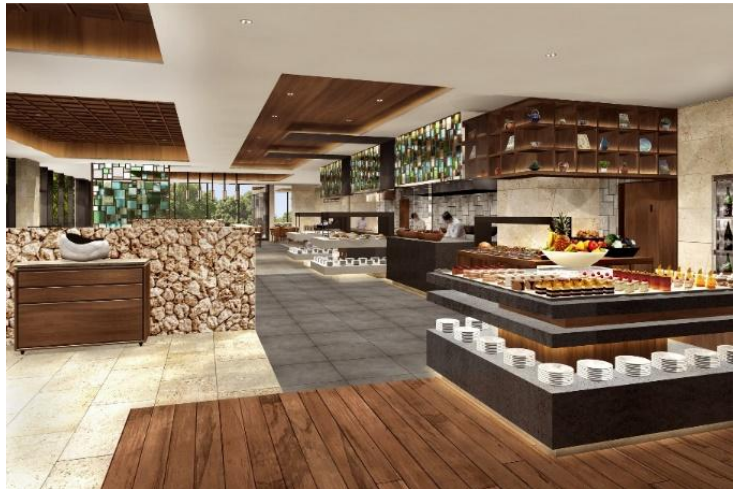
All-Day Dining Venue (rendering)