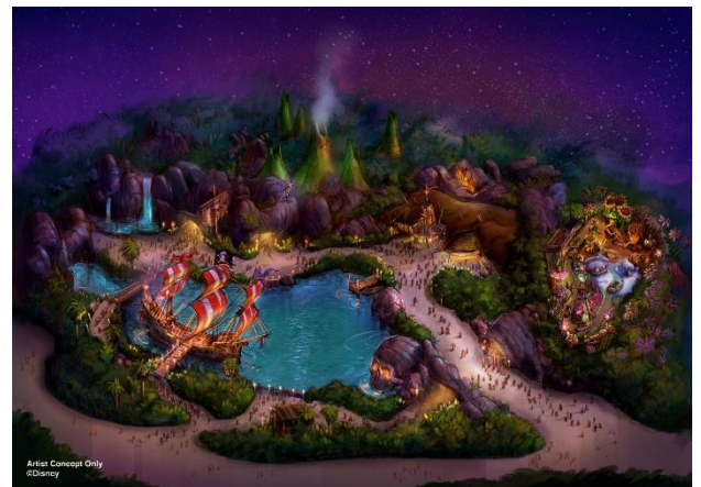
Peter Pan's Never Land (nighttime)