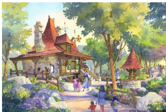
Village in Beauty and the Beast Area (tentative name)