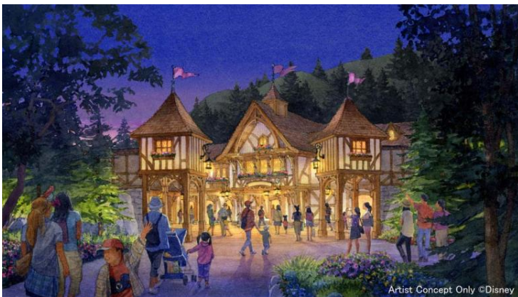
Exterior of live entertainment theater