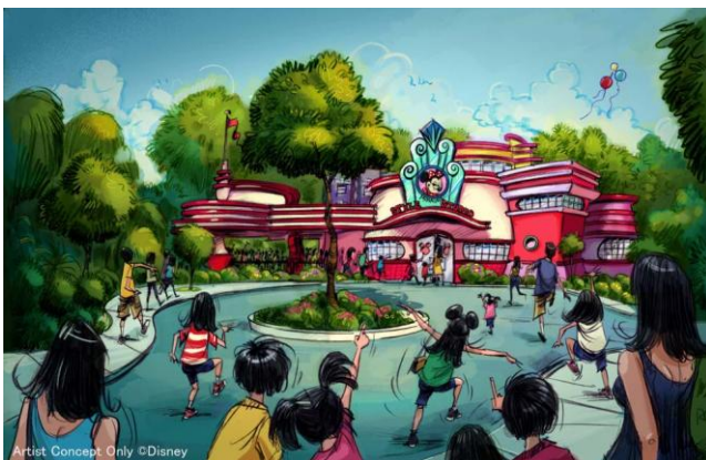
Exterior of greeting facility