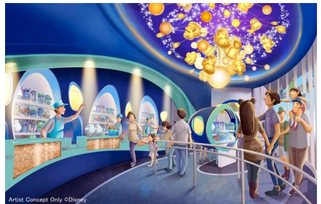
Interior of popcorn shop