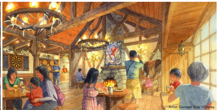
Restaurant in Beauty and the Beast Area (tentative name)