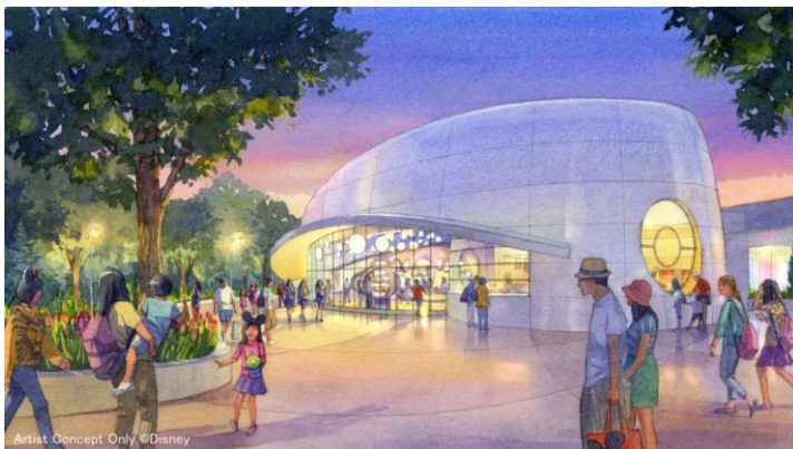
Exterior of popcorn shop