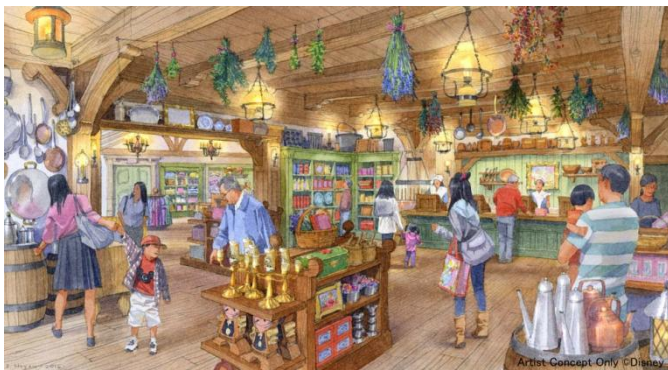
Shop in Beauty and the Beast Area (tentative name)