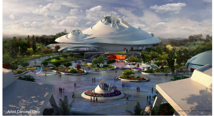
Investment amount: Approximately ¥70.5 billion