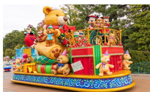
Disney Christmas "Toys Wondrous Christmas!"