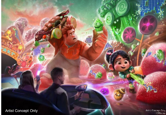
Investment amount: Approximately ¥29.5 billion