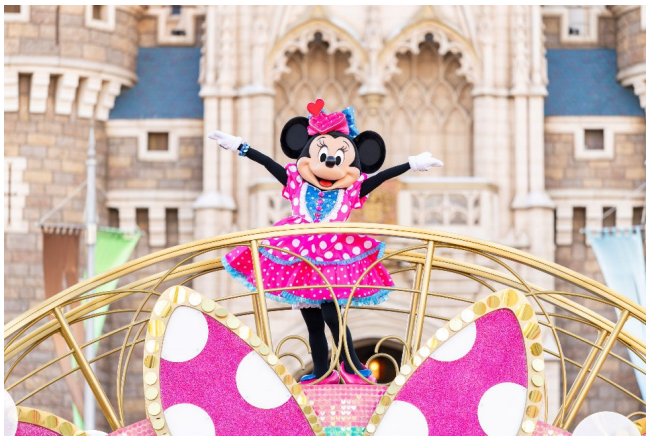
"Disney Pal-Palooza" Part 5: "Minnie's Funderland" at Tokyo Disneyland®