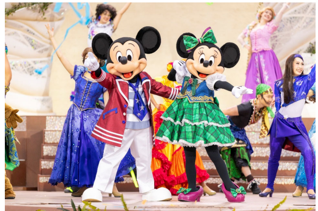
New entertainment show at Tokyo DisneySea® "Dance the Globe!"