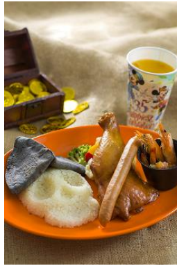
Special Set 1,580 yen at Miguel's El Dorado Cantina