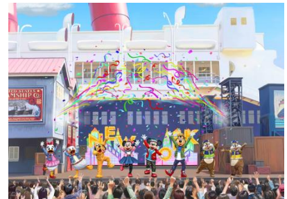
“Hello, New York!” at Tokyo DisneySea

The Disney Friends have come to New York and are looking forward to enjoying its many charms such as Broadway and picnicking in the park. With honking cars and other city sounds in the background, they start exploring the town and discover many fun and appealing aspects of New York. They see New Yorkers doing acrobatic street performances on crates and walls downtown, while on Broadway they see some gorgeous dancing. The Disney Friends are charmed by the city and have a wonderful time. For the finale, the audience joins in and the show comes to a dazzling close.