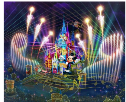
“Celebrate! Tokyo Disneyland” at Tokyo Disneyland

Premiering at Tokyo Disneyland® on July 10 will be the nighttime spectacular “ Celebrate! Tokyo Disneyland ” created especially for the 35th anniversary. With images projected onto Cinderella Castle, colorful fountains, lights that color the night sky and lively music, this show will transport Guests around the Kingdom of Dreams and Magic. Also premiering this summer for the 35th anniversary will be “ Let’s Party Gras! ” at Theatre Orleans in Tokyo Disneyland and “ Hello, New York! ” at Dockside Stage in Tokyo DisneySea® . Both shows will spotlight the 35th anniversary with special scenes.