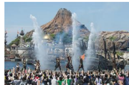
"Pirates Summer Battle 'Get Wet!'" at Tokyo DisneySea