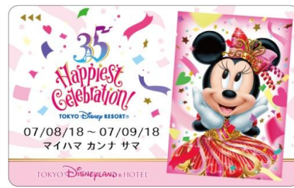
Exclusive 35th Anniversary Design Room Key for rooms in the Concierge and Suite categories (design for July 8 through January 10)