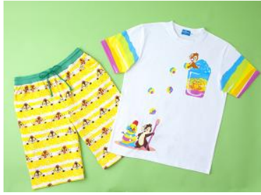
T-Shirts 1,900 to 2,900 yen Shorts 2,300 yen