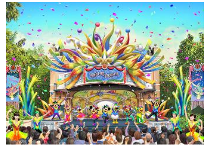
“Let’s Party Gras!” at Tokyo Disneyland

In the show, Donald Duck, José Carioca and Panchito have arrived in New Orleans expecting a Mardi Gras celebration. To their surprise the Disney Friends have planned a special “party gras” that requires four important elements: an artistic venue, happy music, striking costumes and heartfelt dancing. Everything comes together on the colorful stage, with cheerful Latin music and the 35th anniversary theme song playing as the Disney Friends in flamboyant costumes sing and dance. The audience is invited to clap in time and dance to create an even more festive atmosphere and the “happiest” finale for the “Party Gras.”