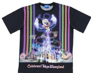
T-Shirts 2,900 to 3,300 yen