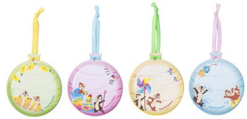
Sticky Notes Set 850 yen

The pictured items are available at Disney & Co.