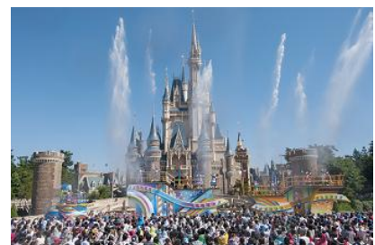
“Disney Natsu Matsuri” at Tokyo Disneyland

Tokyo Disneyland will again give a Disney touch to the traditional elements of a Japanese summer festival in the special event “ Disney Natsu Matsuri. ” The entertainment program “ Sansui! Summer Beat, ” which offers a fun and cooling experience with lots of spraying water soaking the Guests, will have elements exclusive to this summer including a Japanese festival-style arrangement of the 35th anniversary theme song.