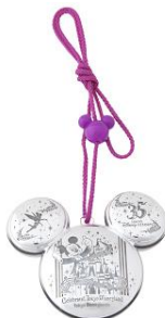
“Light-up Pendant” 1,600 yen

The pictured items are available at Grand Emporium