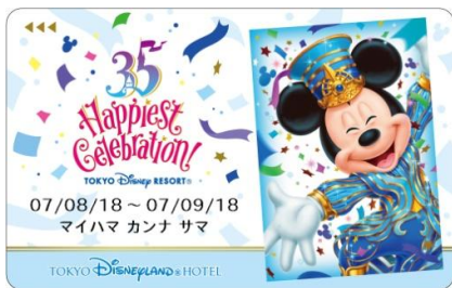
Exclusive 35th Anniversary Design Room Key for rooms in the Standard and Character categories (design for July 8 through January 10)

Note: Special menus will be available from July 8, 2018.