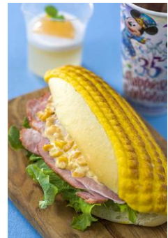
Special Set 1,050 yen at Sweetheart Cafe

Also available during the special event will be a dessert that comes with a Chip 'n Dale souvenir cup, and a dessert that comes with a souvenir plate.