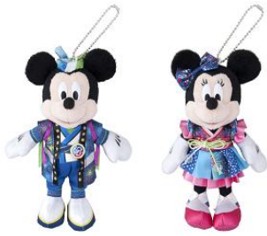
Plush Badges Mickey Mouse, Minnie Mouse 1,700 yen each