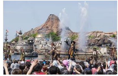
“Disney Pirates Summer” at Tokyo DisneySea

Other programs for summer will be offered at the Disney hotels and the Disney Resort Line . Summer at Tokyo Disney Resort in the 35th anniversary year will offer a wide variety of memorable experiences for all.