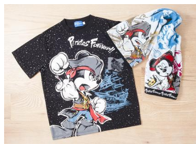
T-Shirts 1,900 to 2,900 yen Towel 1,400 yen