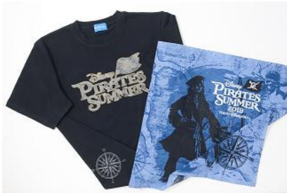
T-Shirt 2,500 yen Bandana 800 yen

About 60 different types of products with designs inspired by the pirates theme will be offered during the special event. T-shirts and bandanas with "Pirates Summer Battle "Get Wet!" motifs and Captain Jack Sparrow designs will be available, and T-shirts and towels featuring designs of the Disney Friends as pirates will also be available.