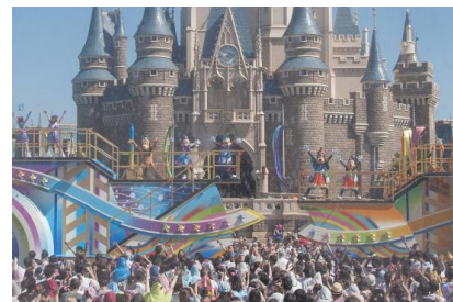
“Sansui! Summer Beat” at Tokyo Disneyland

Note: Water will spray from the five large and small floats primarily in front of Cinderella Castle and along the parade route around the Plaza.