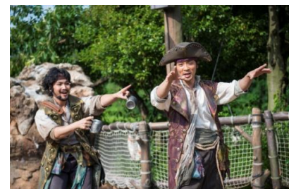
Atmosphere entertainment at Tokyo DisneySea

Guests also have the chance to meet the infamous Captain Jack Sparrow at Lost River Delta and Mediterranean Harbor.