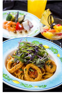
Special Set 1,880 yen at Cafe Portofino