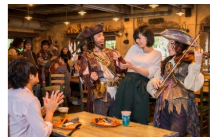
"Pirates Cantina Fiesta" at Tokyo DisneySea

Presented in Miguel's El Dorado Cantina at Lost River Delta, "Pirates' Cantina Fiesta" will feature special menus themed to pirates and decorations that create the ambience of a tavern where rough and raucous pirates like to gather. While they enjoy their meal, Guests will also be entertained