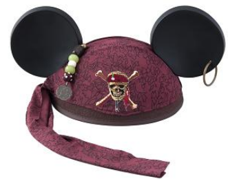
Pirate Ear Hat 2,000 yen

The items pictured above are available at Emporio.