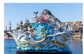
Photo from 2017

Location: Mediterranean Harbor Performances: 3 daily Duration: About 15 minutes Outline: Mickey Mouse and Minnie Mouse, dressed in special