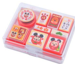
Stamp set (820 yen)