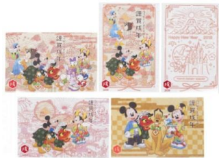
New Year's greeting card set (550 yen)

Note: Special merchandise will be available from Nov. 17, 2017.