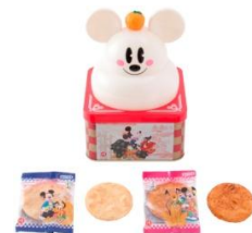
Rice Crackers (1,300 yen)