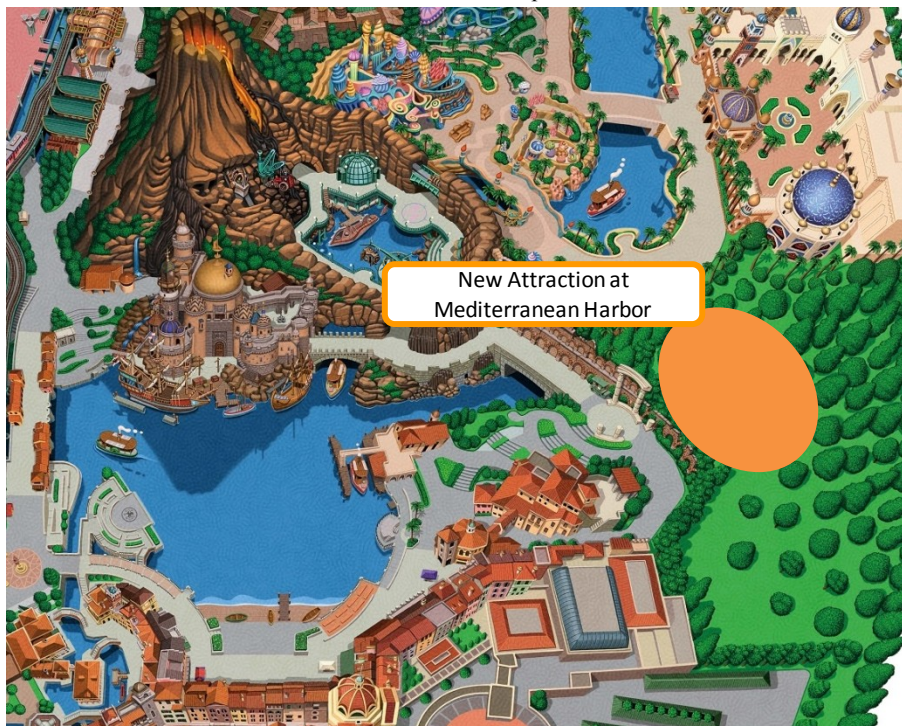
Area to Be Developed

This concept image is not an exact representation of the development area of the facility. © Disney