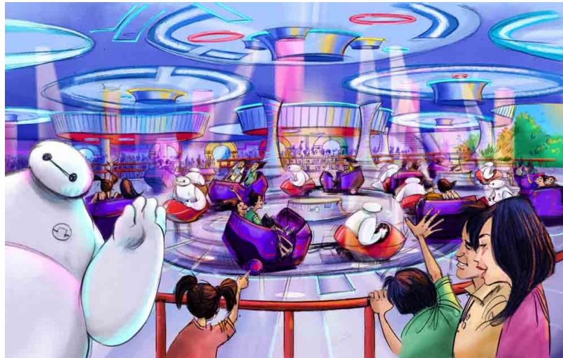
This concept image is subject to change.