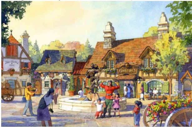
Village in Beauty and the Beast Area (tentative name)