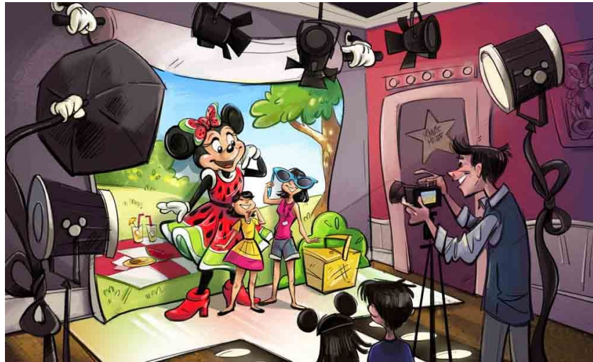
Concept image of Guests experiencing the new Disney Character greeting facility

This concept image is subject to change.