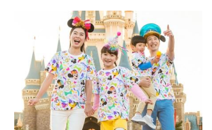
T-shirts, Fun caps, Headbands