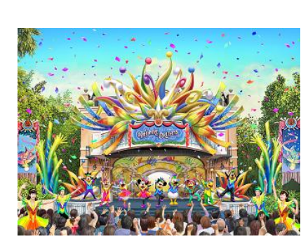
'Let's Party Gras!"

Minnie Mouse, Donald Duck, Daisy Duck, Goofy, Max, Clarice, Jose Carioca, Panchito