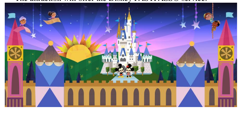
Indoor mural at the boarding area for "it's a small world"

"it's a small world" is sponsored by Nippon Express Co., Ltd. The attraction will offer the Disney FASTPASS® service.