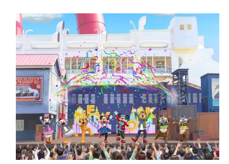
"Hello, New York!"

The Dockside Stage in the New York area of American Waterfront will offer this new show for Guests to enjoy the ambience of this themed port. As Mickey Mouse and his Friends share their ideas about how they wish to have fun in New York, they are introduced to what the city has to offer. The Disney Friends, together with the Guests, learn about enjoying street performances, spending time with dear ones at Central Park, and experiencing a Broadway show. The show will also feature the 35th anniversary theme song and other elements to enhance the anniversary atmosphere.