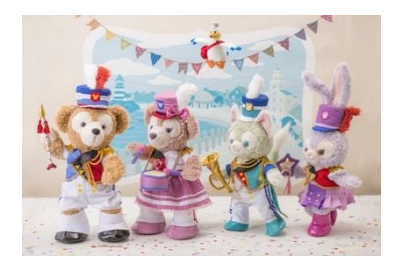
Costume Sets 4,800 yen each Note: Plush toys (S size) sold separately