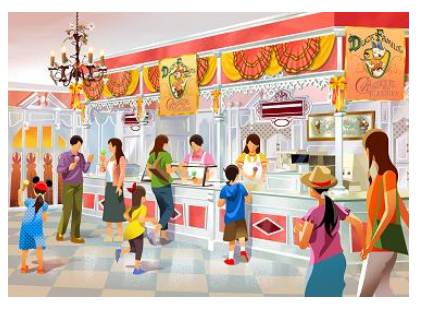
Interior of Ice Cream Cones

Pastry Palace is sponsored by Juchheim's Co., Ltd. and Ice Cream Cones is sponsored by Meiji Co., Ltd.