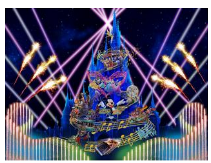
"Celebrate! Tokyo Disneyland" © Disney © Disney/Pixar © & TM Lucasfilm Ltd.

Premiering in summer, the new nighttime spectacular features state-of-the-art projection technology, lasers, water cannons and more for a performance on a grander scale than ever before experienced at the Park. With Cinderella Castle as the stage, Mickey Mouse takes Guests on a magical, musical journey around Tokyo Disneyland.