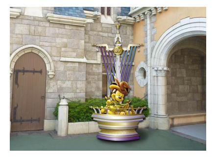
One of the Happiest Mickey Spots

At each themed land of Tokyo Disneyland and each themed port of Tokyo DisneySea will be a statue of Mickey Mouse, each wearing a special costume and enjoying the area in a unique way. There will be a total of 35 of these statues at the Parks for Guests to enjoy during the event period.