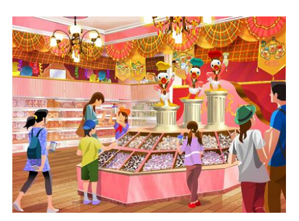
Interior of Pastry Palace

Ice Cream Cones will feature ice cream that uses chocolate crunch, and a souvenir spoon with a chocolate crunch motif.