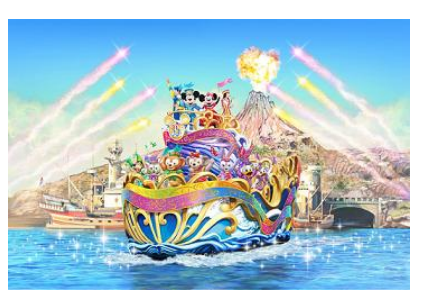
"Happiest Celebration on the Sea"

At Mediterranean Harbor is a brand new show, "Happiest Celebration on the Sea," presented during the "Tokyo Disney Resort 35th 'Happiest Celebration!'" event period. Dressed in their special costumes for the 35th anniversary, Mickey Mouse and other Disney Characters, including Duffy and Friends, will greet Guests from on board a special boat on the waters of Mediterranean Harbor. The greeting will take place to the music of the 35th anniversary theme song.