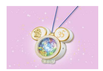
Happiest Memory Maker 2,300 yen