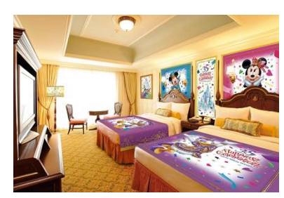
Tokyo Disneyland Hotel guest room with 35th anniversary decorations