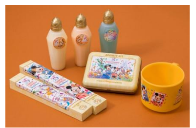
Exclusive 35th anniversary design room amenities at Tokyo Disneyland Hotel